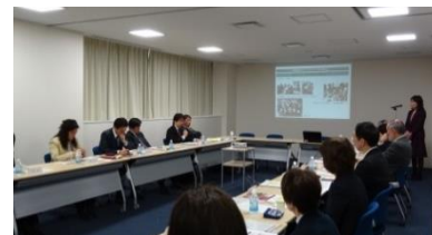
(Project Outcomes Evaluation Meeting on March 4th)

In 2016, to strengthen the collaboration, Sophia University visited 5 partner universities in Brazil, Colombia, Chile; Nanzan University visited a partner institution in Mexico. An orientation for this Program was held for students at the institutions. The interaction among the three Japanese partner universities led to promotion of student exchange with Latin-American region and in March, Nanzan University concluded a student exchange agreement with a Colombian university, one of the 13 partner institutions with which Nanzan did not have any agreement. Nanzan visited an institution in Argentine with which it did not have any agreement to discuss the possibilities.