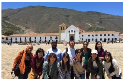
(Intensive Spanish Course at Pontifical Javeriana University )

A total of 22 inbound students in FY2016 exceeded the target number of 19. The domestic multi-campus system is achieving results with 14 participants who took a short-term intensive Japanese language course at Nanzan, moved to Sophia and took courses in their major field of study. Compared to previous year, students taking the intensive Japanese language courses were given a more productive internship opportunity at multiple organizations, that allowed them to try out the results of their Japanese learning and understand the various issues in work places where people with different cultural backgrounds live and work together.