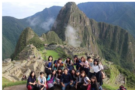
〈 Peru Study Tour 〉