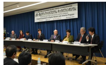
〈 Inaugural Symposium of March 18th 〉

Sophia University concluded student exchange agreements with 4 partner universities which had not yet concluded in this program, and strengthened the cooperation with 9 universities which had already concluded. On March 17th, a program development meeting was held at Sophia University, inviting officials from 7 partner universities in Latin America, and discussed the expected role of this program.