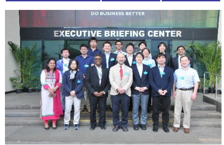
( Company visit in Bangalore)