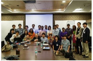
〈 Visiting a company in Bengaluru〉

OJAIST held international workshops and seminars both in Japan and India, and promoted student exchanges. The one held in Bengaluru, India included visiting to Japanese companies' branch offices and opportunities to hear situation of industry in Bengaluru from staff working there.