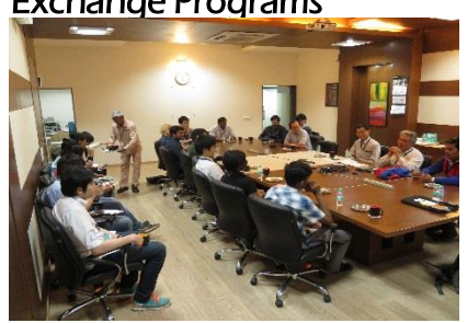
⟨ Workshop in India ⟩

OJAIST conducted short-term mutual student exchanges aimed to participate in international workshops, accepted undergraduate students from partner institutions as the visiting students, and carried out mutual student exchanges for 1 to 3 months under the collaborative education and research co-supervision program. OFor Japanese students participated in an international workshop/seminar, the result of their participation was approved as academic credit by combining with classroom lectures. For Japanese students conducted their research under the collaborative education and research co-supervision program, an internship opportunity was provided at a Japanese company's branch in India. OA coordinator with Indian nationality and staffs in the Center for Global Educational Collaboration attempted to enrich those exchange programs in some ways such as