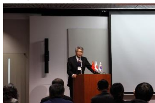
〈Project leader's greeting〉