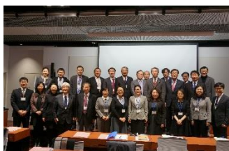
〈International symposium〉 〈TypeA-②〉