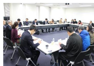
〈International faculty meeting〉