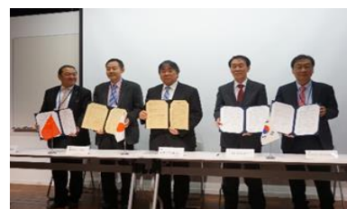
〈Ceremony for agreement and MOU〉

Faculty meetings among partner universities in Campus Asia was held to discuss the agreement framework for credit transfer, grades management, academic degrees as well as student support. The exchanges in information and discussion among the faculties were achieved through the faculty meeting, the international symposium and seminars between the partner departments. Double-degree program will be aimed for Ph.D. candidate students through studies in the home and the counterpart universities to receive lectures and practices and to conduct research and to be mentored for doctoral dissertation by faculties in both universities. When the conditions for acquiring Ph.D. degrees at both universities are fulfilled, the degree will be granted to the student by each university.