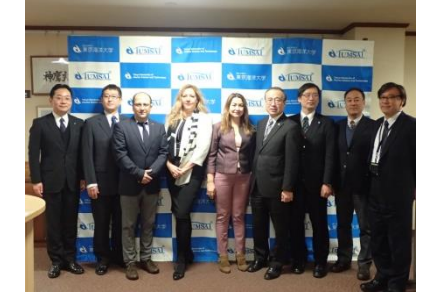
<Roundtable discussion with universities such as Ege University>