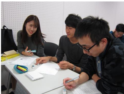
<Students interacting during a language course specially designed for the CAP students>