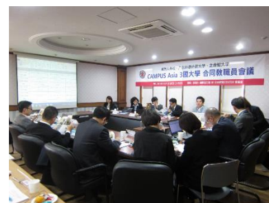
<Joint council meeting of faculty members from the three universities held in Busan, Korea>