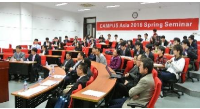
〈Spring Seminar in SJTU 2016/4/26~4/28〉