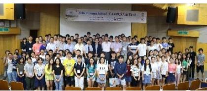
〈Summer School in PNU 2016/8/16~8/26〉