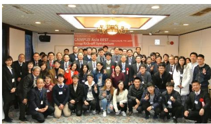
〈Kick-off Symposium in KU 2017/2/22〉