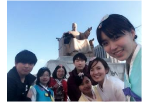
〈Inter-country workshops in Korea〉

Okayama University organized the following programs and hosted 52 students from Jilin and Sungkyunkwan University during the fiscal year of 2016: exchange student of half to one year (China 4, Korea 9), Short courses of 2 to 3 weeks including Language and culture, Spring School, Nano - biotechnology program (China 15, Korea 37)