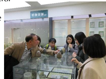
〈Environmental and life science seminar in Jilin University〉