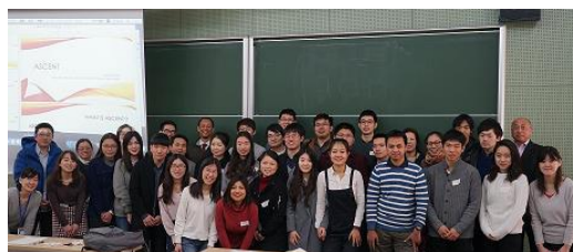
〈21 st Century Skills Seminar〉

The following activities were implemented in FY 2016.