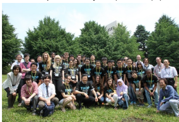
TiROP students and faculty members

The research-oriented Summer Program, (3) above, consists of short-term research projects, lecture-based coursework on common themes, and coursework in specialty fields in English under the name Tokyo Tech International Research Opportunity Program (TiROP), in which undergraduate and master's students join a laboratory for the summer and possibly the fall term. The Joint Educational Program, (4) above, consists of research activities at partner universities for a fixed period on research themes jointly set by Tokyo Institute of Technology and partner universities. After this project has concluded, the Summer Program will continue as "Tokyo Tech Summer Program" and will accept 31 students in the summer of 2016.