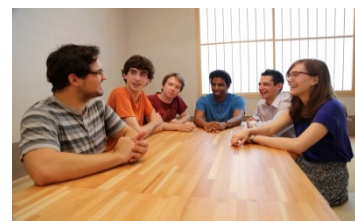
Summer Program student