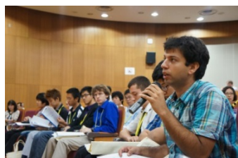
Summer Program student discussion

In implementing the program, the Institute has established a unique website associated with the existing Tokyo Institute of Technology English website and partner universities' websites, providing information to a wide demographic community extending beyond participating students. Moreover, to assist partner universities with the possibility of credit transfers, the Institute uses a Study and Research Plan/Record as well as a grade management system showing strong commonalities between partner universities.