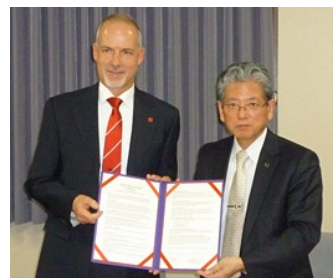
(Signing of MOU on jointly supervised PhD program)

An MOU on a jointly supervised PhD program was concluded with Johannes Gutenberg University Mainz (Mainz) in February 2015 as part of our promotion for the Graduate Program in Spintronics. Similar MOUs will be made in other fields hereafter.