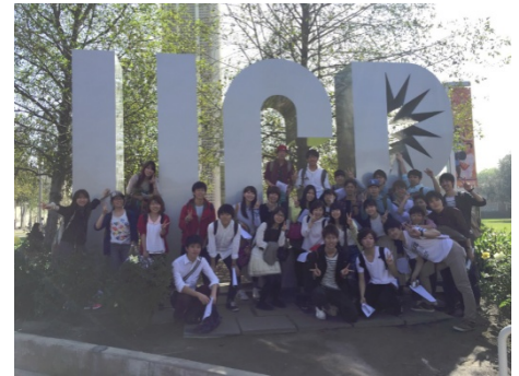
(Study Abroad Program)

As a pillar of our effort to provide global education to Japanese students, we are focusing on developing and implementing university-wide short-term overseas programs such as the Study Abroad Program (SAP) as well as other short-term programs that leverage departmental strengths. Over 400 undergraduate students participated in FY 2014. Moreover, the Pre-enrollment Overseas High School Bridging Training Program, first implemented last year, proved popular and was implemented again in March 2015.