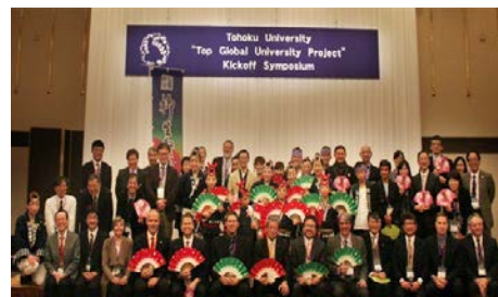
(SGU Kickoff Symposium)