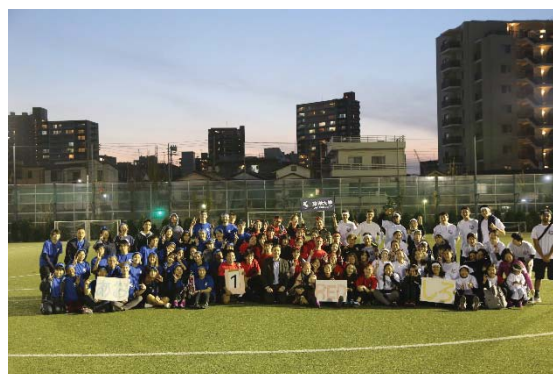
<Exchange activities between international and Japanese students: Photo from sports day held by the Center for Global Education and Exchange>

<Final Target 10.3%⇒ FY 2019 5.3% > To increase the number of students studying abroad, we are working on several initiatives. These include the establishment of a Toyo University scholarship, linking regular and extra-curricular courses to improve English ability, diversifying programs using faculty training, promotion of overseas dispatch by coordinating with external institutions, as well as training that utilizes overseas offices. However, due to the impact of COVID-19, results were lower than last year.