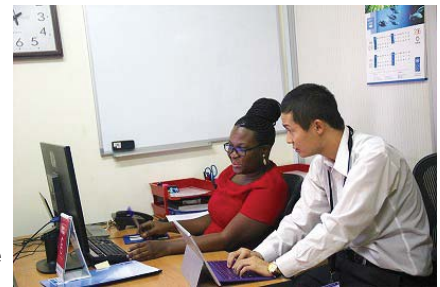
Internship at UN Youth Volunteer in Uganda

We established an exploratory committee on bridge programs and international transfer admission system where issues such as different types of study abroad programs and their promotions are discussed. We also organized and implemented various types of outbound study abroad programs to meet the diverse needs and language levels of students. Furthermore, the number of students who participate in highly competitive study abroad programs, such as the UN Youth Volunteer program and the Tobitate program, has been increasing.