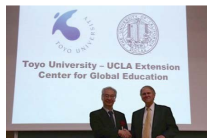
< Alliance with UCLA Extension >

"Toyo - UCLA Extension Center" will provide the BEC (Business English Communication) Program. Also, Toyo University students will be able to take the course "Business English" from the 2015 academic year as a standard undergraduate course. This course uses the same curriculum as the UCLA Extension Center's BEC program, allowing students to continue extra-curricular studies to receive certification from the UCLA Extension Center. Going forward, there will also be global education opportunities held for all generations, from elementary school students to senior citizens, as we will plan and operate English programs for preschool, elementary, junior high, and high school students and senior citizens, study abroad support programs, and summer overseas study trips.