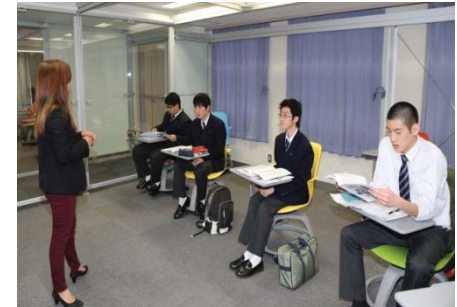
English program for students of an affiliated high school

A wide variety of multi-generational English education programs was offered in FY 2017. The Business English Communication Program at the Toyo-UCLA Extension Center; Business English Presentation Program; and the Toyo Achieve English program for kids and adults attracted 246 participants from a broad array of different age groups. Toyo is also establishing a new educational collaboration model between high schools and universities by providing English programs for students of Toyo-affiliated high schools.