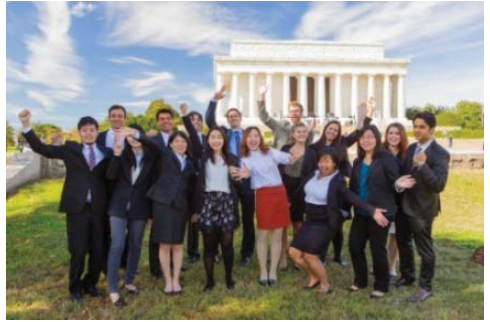
〈The Washington Center〉