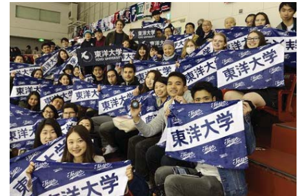
Japanese and international students cheering on the Toyo ice hockey team

In order to accept more degree-seeking students from abroad, Toyo participated in recruiting fairs in 18 countries and regions. As a result, 240 students from 26 countries and regions applied for the Pre-Arrival Entrance Exam (Type A: Admission in April and September). In addition, Toyo started offering different programs to attract international students such as short programs for overseas partner universities and customized short programs. To support the increased number of international students, Toyo began offering extensive Japanese language education, promoting interaction among students, and providing career supports.