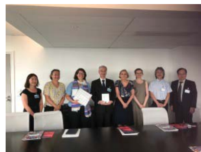
Signing Ceremony at Sorbonne University

In order to promote internationalization of education, we actively seek partner institutions abroad who provide high quality educational opportunities and can accept our students for exchange under bridge programs. In FY2018, we signed 38 new agreements, including one with Sorbonne University in France. This brings the total number of agreements up to 182 and student exchange agreements (including those for fee-based exchange) up to 114 from 87 from the previous year, significantly expanding the array of study abroad opportunities for students. We also actively participated in international conferences such as AIEA, and increased Toyo's profile by delivering a presentation on higher education in Japan.