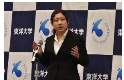
English Speech Contest (Winner)

In FY2018, 786 students achieved target level language scores. We are also increasing the quality and quantity of our extracurricular language programs, opening 48 courses attended by 2,235 students (2,369 in FY2017). As an opportunity for students to demonstrate their achievements in learning English, we again held the English Speech Contest this year and introduced our first ever English Presentation Contest.