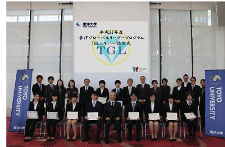
Toyo Global Leader Silver Award ceremony

The TGL program was launched university-wide and 11 TGL camps were held throughout our campuses. In addition, 12 students (increased to 16 by the end of FY 2016) were awarded TGL Silver Status as the first awardees. We held a TGL Silver Award Ceremony in February 2017 where the president presented the TGL Silver Certificates to the students.