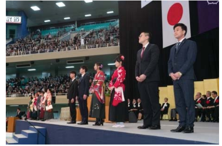
Toyo Global Leader Gold Award Ceremony at the graduation ceremony (FY2017)

Thirteen students were awarded TGL Gold Status as the first awardees since the TGL program was launched. The TGL Gold Certificates were presented by the president at the graduation ceremony. In addition, 91 students were awarded TGL Silver Status. The number of participants in TGL camps increased from 691 in FY2016 to 2,636 in FY2017. This nearly fourfold increase demonstrates the extent to which the TGL program has been embraced at Toyo.