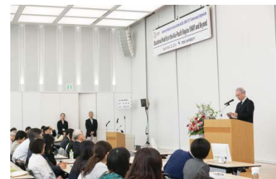
Opening remark by president at the international symposium of UMAP

As the International Secretariat of UMAP (University Mobility in Asia and the Pacific), we facilitated two international board meeting in Malaysia and Japan respectively. On September 23 rd , 2016, we hosted an international symposium on student mobility in Asia Pacific region celebrating 25 years of UMAP's history at our Hakusan Campus, where 200 education professionals attended from Japan and abroad.