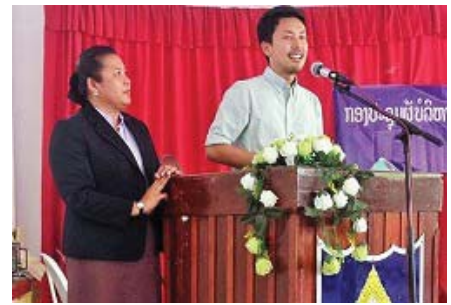
<The Tobitate program>

In the 2013 academic year, 155 students achieved the target score, and in the 2014 academic year, that number increased to 288. We are also expanding the quality and quantity of our extra-curricular programs, hiring 15 native English-speaking instructors to improve the level of teaching of the 4 language skills, as well as expanding our IELTS preparatory course lineup.