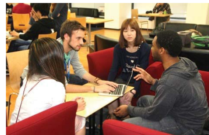
Communication among Japanese and International students

In order to accept more international degree-seeking students, Toyo changed its application period for international undergraduate students from September last year to July this year. As a result, the number of applicants increased from 53 applicants from 8 countries in FY2016 to 123 from 19 countries in FY2017. In addition, Toyo started offering undergraduate admissions in September in order to correspond with overseas school calendars. This year we received applications from 117 students from 17 countries. Two coordinators were assigned to the International Affairs Office to provide international students with various supports.