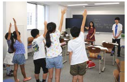
<Toyo Achieve English>