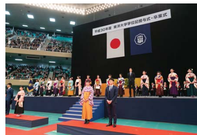
Toyo Global Leader Gold Award Ceremony at the graduation ceremony (FY2018)