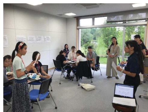
<Photo from domestic English camp program for middle and high school students at the Kawaguchiko Seminar House>

When looking for partner universities, we proceed with concluding partnerships with universities that provide high-quality education programs, or those that have bridge programs. As of FY 2019, we have concluded new partnerships with 33 universities and educational institutions. As a result, we have 214 comprehensive partnerships, amongst these, there has been an increase in exchange student partnerships from 112 universities and two consortiums to 134 universities and two consortiums, and the options for study abroad have increased for Toyo University students. Also, continuing from FY 2018, we have concluded one new partnership with a long-term study abroad support group from North America, leading to an expansion in opportunities for long-term study at Toyo University from abroad. We are also proactively attending international conferences such as NAFSA, EAIE, APAIE, and AIEA, and a Toyo University faculty member performed a presentation regarding the internationalization of Japanese universities focused on the SGU program, which increased the presence of Toyo University.