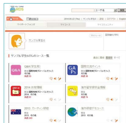
< Visualization of Learning Outcome through E-portfolio >

Through the Toyo University - UCLA Extension Center for Global Education, joint courses will be developed for all generations for a total of 500 courses and 10,000 participants by 2023.