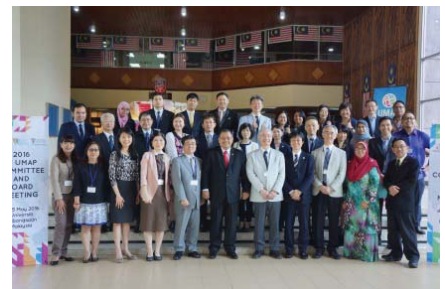
<UMAP Board Meeting>

We undertook International Secretariat of UMAP (University Mobility in Asia and the Pacific) from January FY2016 for five consecutive years. This will contribute to promoting flexible international student transfers in the higher education level within the Asia-Pacific region. In recognition of the importance of increasing numbers of participating countries / regions in revitalizing student exchanges, we are preparing to review the exchange scheme to encourage more students in Japan to go study abroad through UMAP.