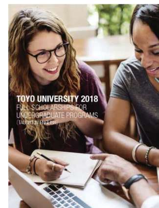
TOYO UNIVERSITY 2018 FULL SCHOLARSHIPS FOR UNDERGRADUATE PROGRAMS (TAUGHT IN ENGLISH)

Aiming at attracting highly talented international students and promoting internationalization at Toyo University, we established the "Toyo Top Global Scholarship". For academic year 2017, 53 students applied from all over the world, and 38 were selected to receive the scholarship and enter Toyo University in April 2017. We will continuously strengthen our international public relation activities and overseas recruitment to acquire and educate talented international students.