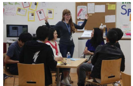
<International Communication Space>

"Diversity Voyage", an overseas training program in which students make a solution through a fieldwork project out-side of Japan, has been held. Many students have joined this program even though they had rarely been abroad (there were 117 students from all faculties who went to Thailand, the Philippines, Malaysia, and Laos in FY2015 through this program) and have been engaged in international activities in and outside of Japan.