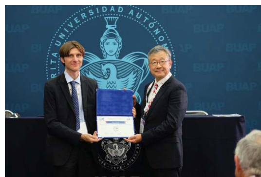
<Photo of the receiving of ISAS2.0 Learning Badge at the IAU International Conference>