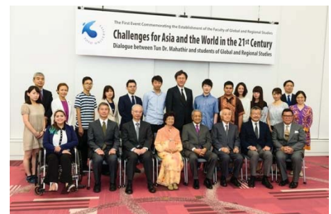
Special Event with H.E. Mahathir Department of Global and Regional Studies

The Faculty of Regional Development Studies was dramatically restructured and renamed Faculty of Global and Regional Studies. Within this new faculty, Toyo established the Department of Global Innovation Studies (GINOS), which provides a global learning environment by teaching all subjects in English, requesting all Japanese students to study abroad for a year, and allocating 30% of its admissions quota to international students. In addition, the Department of International Tourism Studies was rechristened as Faculty of International Tourism Management—all two years ahead of the original plan. Finally, the Faculty of Information Networking for Innovation Design was opened at our new Akabanedai Campus.