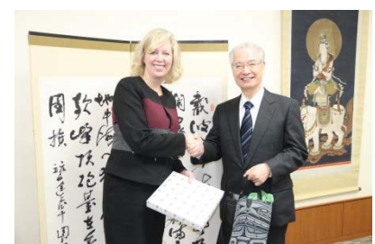
Signing Ceremony with Douglas College (Canada)

In order to promote internationalization of education, we actively seek partner institutions abroad. In FY 2017, we signed 47 new agreements. This brings the total number of student exchange agreements (including fee-based exchange) up to 87 from 65 of FY2016, resulting in an expanded array of study abroad opportunities for students. We will continue our efforts to broaden our international network by participating in international academic fairs and visiting potential partner institutions.