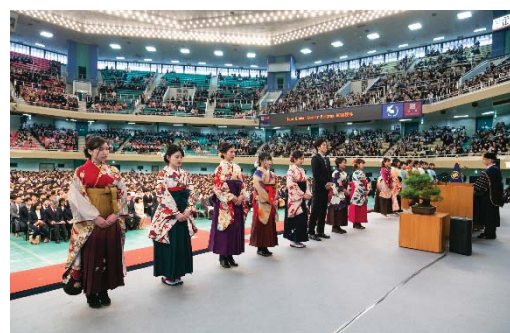
< The FY 2019 certification ceremony was cancelled due to the impact of COVID-19. Photo from FY 2018 certification ceremony (at graduation ceremony) >

Since 2018, we outsourced part of the global education program for all generations from elementary school students to seniors to Toyo University Global Service (TUGS), which was 100% funded and founded by Toyo University Incorporated Educational Institution. TUGS began operating domestic English camp programs at the Toyo University Kawaguchiko Seminar House from April 2019. The program is equal to studying abroad where students can put themselves in an English-only living environment but is a more accessible alternative opportunity to learn English. We expect it to be used not only by Toyo University Students but also widely by the public, from middle school students to adults. Along with English language program outsourcing, TUGS is expanding its operations to include insurance brokerage, introducing accommodation to students who do not live at home and contracting of various internationalization related services, including international student support. Going forward, TUGS will be more deeply involved in the operation and planning of international education exchange programs, and we plan that while holding the function of the education platform, TUGS will go on to return profit.