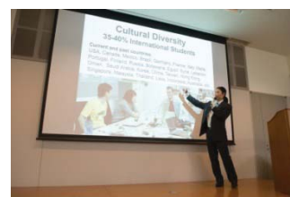
Keio Creativity Initiative Symposium

In 2014-2015, the University launched the three transdisciplinary initiatives of Longevity, Security, and Creativity. Kick-off symposiums for each initiative marked the beginning of advanced education and research within and between initiatives. As of June 2015, research centers for each initiative have been set up within Keio Advanced Research Centers (KARC) with a total of nine initiative-based research projects currently selected to receive internal research funding. This research will serve as the basis to attract other research projects and obtain external research funding to invite exceptional researchers from overseas for joint research. Keio expects to attain better international visibility by publishing high-quality papers jointly authored with international researchers and ultimately boost the University's international dimension.