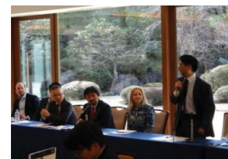
The Internet in Asia: Looking Ahead to 2025

The University has established a discretionary fund for the President to use swiftly and flexibly in order to inject funding and accelerate reform. This fund has made it possible for the University to prioritize and selectively consolidate resources on exceptional projects in need of funding. This fund helped bring together leaders from the business, academia, and government from throughout the Asia-Pacific region for candid discussions concerning key issues for the future of the Internet at the Association of Pacific Rim Universities' (APRU) Internet Business Offsite: "The Internet in the Asia-Pacific – Looking Ahead to 2025," which was held from March 10-11, 2015, at Keio University.