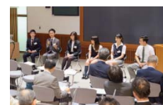
Study abroad debriefing meeting

The program was launched in 2014, and in July 2016 a debriefing meeting was held with members of the first group of students who participated in the program. It was apparent that by living with the brightest students from around the world and interacting with them through studying and extracurricular activities, the students were able to not only improve their English, but gain new perspectives and the ability to proactively take action and seek new challenges. It is hoped that these students will create a ripple effect of inspiration among their classmates.