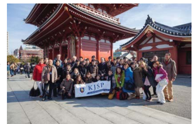
Keio Short-Term Japanese Studies Program

The development of short-term programs is underway to increase the number of international students who come to Keio. Thesis@Keio, a program geared towards graduate students, began in 2015. Graduate students at the master's or doctoral level who are accepted to the program are allowed to conduct research at Keio and gain access to university resources. They may conduct fieldwork and interviews and receive advisement from Keio faculty members for their research. This new system provides students from other universities direct access to Keio academic faculty in order to further their research while Keio benefits by building an international academic network with talented graduate students and early-career researchers from abroad. Additionally, numerous new programs are slotted for Summer 2016 and beyond across many different faculties and graduate schools.