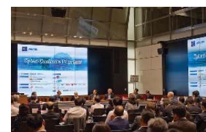
During the symposium

This symposium, jointly hosted by Nikkei Inc., Nikkei Business Publications, the Cyber Security Research Center at Keio University, and other entities, saw many lectures, panel discussions, and workshops with various themes. These included: "Next Generation Security Operation Center for the AI Era"; "Leadership for Cybersecurity Management"; and "Roles and Responsibilities of the Government and Private Sectors." A signing ceremony was also held at the opening of the symposium proceedings for an academic partnership agreement with the Georgia Institute of Technology as part of the activities of INCS-CoE. Lively industry-government-academia exchanges, bringing together governmental actors and prominent experts in the cybersecurity field and delegates from universities participating in INCS-CoE from Japan and overseas, were seen at the venue.