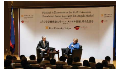
Chancellor Merkel talking with students