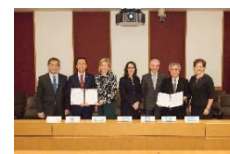
Tokyo Statement signing ceremony

The "Global Network of Research-Intensive University Networks: 2016 International Annual Meeting" international conference was held at Keio University's Mita Campus for two days from November 7 to 8, 2016. The purpose of this conference was to bring representatives from research-intensive university networks from different countries and regions of the world together to discuss common issues, and work towards solutions through mutual collaboration. RU11 (Japan), of which Keio University is a member, has been part of this global network since 2014. In addition to RU11 members, approximately 30 representatives from networks including, AEARU (East Asia), C9 + HK3 (China), German U15, Group of Eight (Australia), LERU (Europe), and U15 Canada participated. Keio University, which is in charge of international matters of RU11, hosted and chaired the conference.