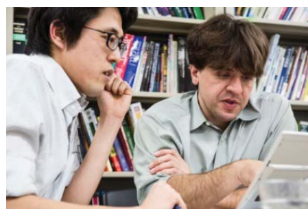
A visiting research co-advisor meets with a Ph.D. candidate

The university commenced full operation of its cross-appointment scheme to employ researchers from abroad as visiting research co-advisors to advise doctoral candidates at Keio. In AY2015, Keio welcomed a total of 60 co-advisors. Just as the year before, all parties involved—main research advisors, visiting research co-advisors, and doctoral candidates—expressed a high degree of satisfaction with the scheme. Several joint research and co-authored papers have been or are currently in the process of being published. The university expects their contributions will have a positive impact on citation and ranking indices.