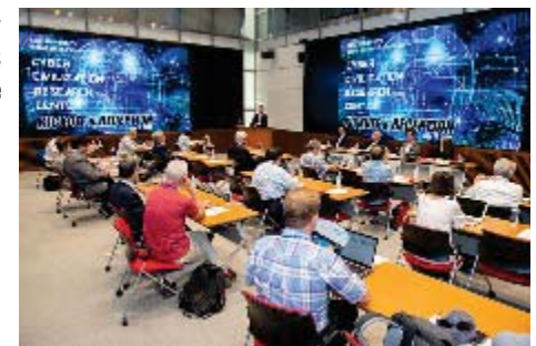
CCRC kickoff event