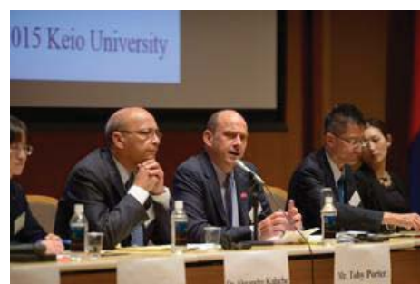
International Conference on Cognitive Decline and its Economic Consequences Co-hosted by Keio University and the World Economic Forum

Keio Ageing Week was held from Sunday, October 4, to Friday, October 9, 2015. Organized by Keio University with the collaboration and cooperation of various organizations, including the World Economic Forum (WEF), the World Health Organization (WHO), and Osaka University, the week consisted of an international conference and various events including lectures focused on healthy ageing, or more specifically, exploring solutions to challenges related to an ageing society. World-leading researchers convened to discuss issues related to a super-ageing population and cognitive decline as part of Keio University's ongoing research on longevity, one of Keio's global initiatives and a field in which Keio has long had a strong reputation. This meeting provided new insights needed to spark joint research on building a society that can cope with an ageing population through ongoing interdisciplinary and international research.