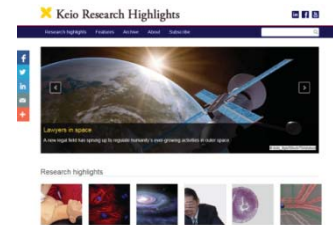
Keio Research Highlights

The Global Interdisciplinary Courses (GIC) Center was established in 2014 to design the GIC Program, which started in April 2015. Keio's first university-wide curriculum conducted in English, the GIC Program is available to students across all of Keio's undergraduate faculties and graduate schools and will function as a platform that works towards developing courses which allow more students to study and graduate in English. The GIC Program launched with 13 Core Courses and 172 Research Courses that offer GIC credit.