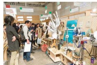
Open Research Forum

In 2014-2015, Keio's research greatly exceeded many of its research targets. For example, the total amount of commissioned research grew 23% to 64 billion yen, and the total number of domestic/foreign patents grew 53% to 988. The University also established a hub for collaborative research with the U.S. National Institute on Aging, a world leader in aging and longevity research.