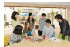
Hiyoshi International Dormitory