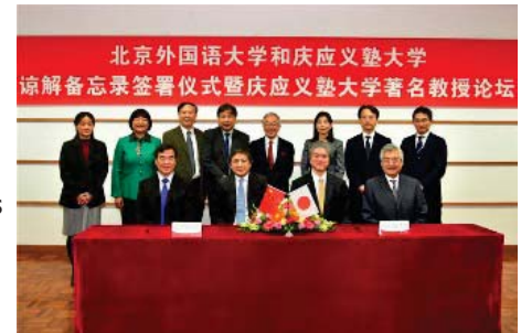
Signing ceremony with the Beijing Foreign Studies University. An event introducing research at Keio and a panel discussion were also held for local students.

In May, the IBM Q Network Hub, a forefront quantum computing research base was established in the Faculty of Science and Technology. IBM Q is a state-of-the-art general-purpose quantum computer being developed by US technology company IBM, and this hub is the only facility in Asia enabled to use IBM Q's cloud computing system.