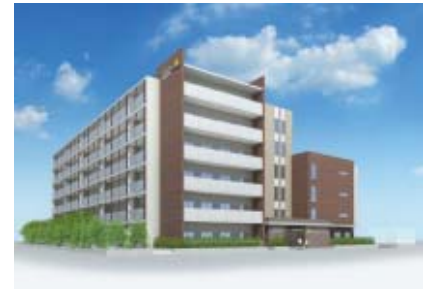
3D rendering of Hiyoshi International Dormitory* (*Name tentative)

Keio has gradually added international housing with the increase in international student numbers, and in March 2016 the university opened the doors to the Okurayama Dormitory, the university's newest housing complex designed with international students in mind. In March 2017, Hiyoshi International Dormitory*, the university's first attempt at a truly international dormitory, is slated to open. Additionally, Keio has plans to open another international student dormitory at Tsunashima Sustainable Smart Town in Yokohama by March 2018.