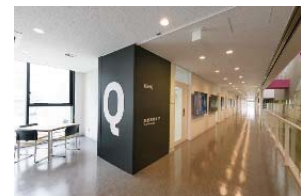
Common Room of the IBM Q Network Hub

An IBM Q Network Hub was established as a center for cutting-edge quantum computer research within the Quantum Computing Center at the Faculty of Science and Technology at Yagami Campus. IBM Q is a cutting-edge quantum computer for general use developed at IBM (United States), and this will become the sole hub in Asia enabled to use IBM Q's cloud computing system. The hub will contribute alongside four corporate members to quantum computer studies, skill development, and implementation, with the aim of facilitating advances in quantum computing. Keio University, with developers from participating corporations, will access the 20-quantum-bit commercial IBM Q quantum computing system equipped at the New York State hub through the cloud, and thus promote development of quantum applications in close cooperation with educators, researchers, and students.