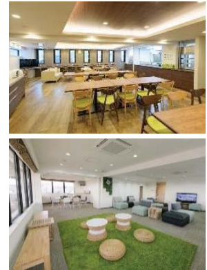
Inside the Dormitory