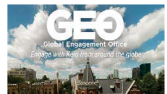
Global Engagement Office website

In April, the Office for Equity, Diversity, and Inclusion was established with the aim of developing a campus environment that recognizes diversity. In November, the Global Engagement Office (GEO) was established to expand IR and international public relations activities.