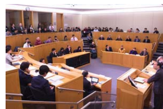
President Seike gives a lecture at Harvard

President Seike met with Harvard President Drew Faust before giving a lecture as part of Keio's Longevity Initiative, titled "Japan's Aging Society and the Role of Higher Education," to a large audience which included many researchers and students. At the reception that followed, researchers from both institutions discussed opportunities to strengthen the Harvard-Keio relationship through joint research and academic exchange. Many Harvard students also showed a keen interest in studying in Japan at the information sessions held by Keio staff the following day.