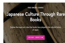
FutureLearn registration page

Keio University signed a Course Distribution Agreement with FutureLearn, the UK-based MOOC provider, making it an official member and the first from Japan to join the platform. In the 2016 academic year, two courses were provided: “Japanese Culture Through Rare Books” which looks at Japanese culture through writings from the earliest period in which books were written in Japan (8th century) to the Meiji Period (1868–1912), and “An Introduction to Japanese Subcultures” in which students study Japanese youth culture from the 1970s onwards. Both courses were taken by many people from around the world and received good reviews.