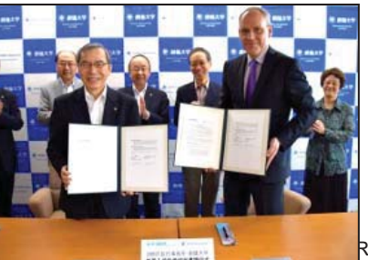
〈Establishment of the “Russian Center”〉

The first “Russian Center” at a university opened on Soka University’s campus in June 2016 by receiving in-kind support from Russkiy Mir Foundation. The center will be in charge of promoting Russian language and culture by cooperating with the Foundation and the Embassy of the Russian Federation to Japan.