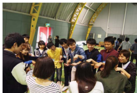
< Project adventure study session of Active Learning >

Established in year 2000, Center for Excellence in Teaching and Learning has took the lead in promoting collaborative learning and FD programs at Soka University. The achievements being acknowledged, Soka University was selected for the AP Project in fiscal 2014. In this AP Project, we will enrich the quality of our active learning, and through visualizing the achievements and putting efforts in the assessment process, we will implement active learning in 80% of the entire courses. All students will then register for at least 4 classes that implement active learning. With the campus-wide development of active learning, Active learning style such as "Learning Through Discussion (LTD)" and "Project Based Learning (PBL)" have been promoted campus-wide. This has improved the international competency of the bachelor's degree program at Soka University.