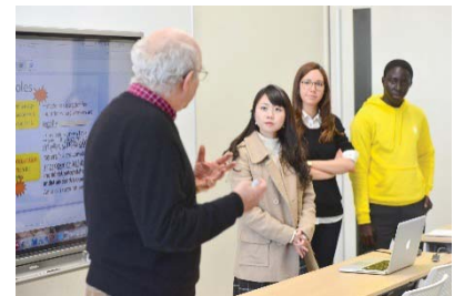
〈English Track to be extended to 11 courses〉

In addition, by making documents in English for meetings that affect the whole university, such as the University Education and Research Council, it is now possible to hold faculty meetings in English.