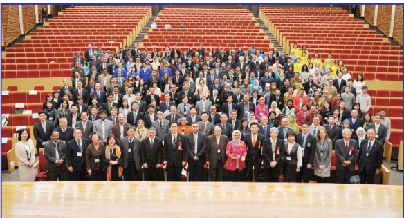
Hosting of the annual ASAIHL conference for the first time in Japan

• Soka University hosted the annual conference of the Association of Southeast Asian Institutions of Higher Learning (ASAIHL) in March 2018, in which about 200 researchers from Southeast Asia, Europe, North America, and Japan participated.