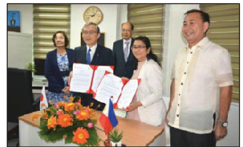
Opening of Soka Univ. Philippines Office