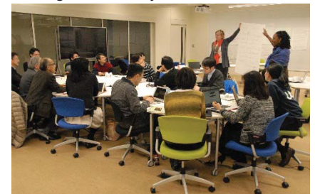
〈 Short-term FD program on campus 〉

In fiscal 2014, we sent 1 faculty to Teachers College, Columbia University for one semester, and held specialized classes to the local students in English. In addition, for the purpose of improving their skills in teaching to non-English students, we conducted a short-term FD program on campus in which we invited two lecturers from the University of Southern California, and 17 faculty participated in the program.