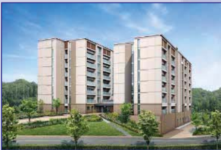
International Student Dormitory to accommodate Japanese and foreign students (Scheduled for completion in spring 2017; Artist's impression of the building for male students)

As of May 2016, 447 foreign students (5.6% of all Soka University students) from 47 countries/territories on five continents are studying at Soka University. To further enhance this environment, in which foreign and Japanese students study together, a new International Student Dormitory is planned, in addition to the current one, which houses 100 male and 100 female students. Accommodating 400 male and 144 female students, the new facility will be completed in the spring of 2017. The new dormitory will accept both Japanese and foreign students to encourage the development of their intercultural communication skills.