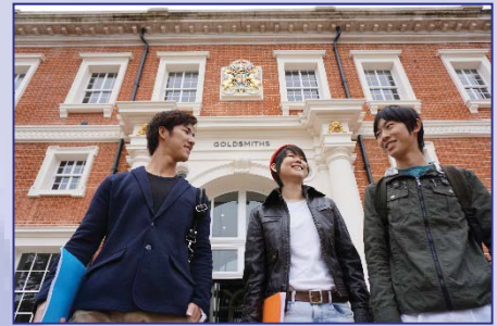
Students of the Faculty of International Liberal Arts studying at Goldsmiths, University of London

Established in FY2014, the Faculty of International Liberal Arts allows students to graduate after taking only courses given in English. The faculty requires students to study abroad for about one year from the second semester of their first year to the United States, the United Kingdom, Canada, and Australia. In FY2015, including these students, total of 971 Japanese students (12.4% of all Soka University students) studied abroad.