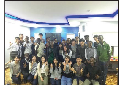
〈Study abroad programs to Africa〉

We newly built short term study abroad programs in Kenya, India and Myanmar in FY 2016, and the participants of overseas internships and volunteers reached 100 and 111 respectively. The target in FY 2023 is 150 student participants for both internships and volunteers.