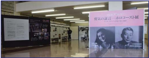
Hosting of a Holocaust exhibition to consider peace and human rights (open to the public)

• Soka University was selected from all universities with comprehensive agreements with Hachioji City, to cooperate for the “JICA Grassroots Technical Cooperation Project.” This is a joint collaboration project with Hachioji City and the Japan International Cooperation Agency (JICA), and all three parties concluded the project contract. To date, faculty members and students of Soka University have been sent 3 times to the Federated States of Micronesia, where the project is being implemented, to conduct public awareness activities aimed at reducing and reusing a large amount of trash in order to reduce the volume of solid waste.