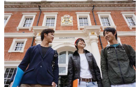
〈 Students of Faculty of International Liberal Arts studying at London University, Goldsmiths 〉

We aim to increase the number of students with overseas experience to 80% of the entire undergraduate students, and students earning credits in overseas universities to 1260 students by fiscal 2023. In fiscal 2014 there were 933 students studying abroad, which includes 78 students in the Faculty of International Liberal Arts (FILA), a newly established faculty where students can graduate by only taking lectures in English. FILA students study abroad for one year from their second semester to four universities in the U.S., U.K., Canada, and Australia, and about 20 students study at each destination respectively. From this fall semester, they are scheduled to take specialized courses in English.