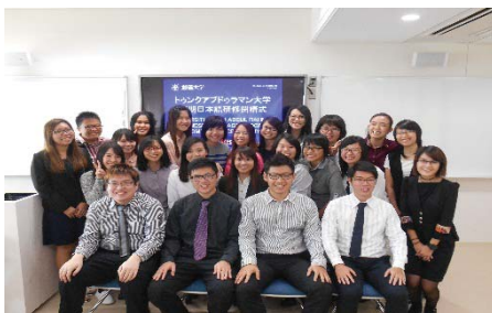
〈 Participants of Japanese language and culture study program from Malaysia 〉