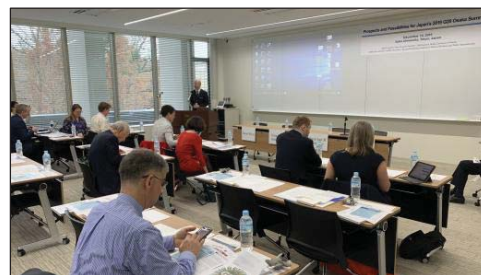
A scene from G20 Research Conference

A research conference was held at Soka University on Dec. 10, 2018, to discuss issues in preparation for the G20 Summit to be held in Osaka in June 2019. It was hosted jointly by Soka University's Peace Research Institute, University of Toronto's G20 Research Group, Griffith University's Asia Institute, and the Russian Presidential Academy of National Economy & Public Administration. The event was attended by about 30 people, including diplomats, researchers, and business people. Session meetings were held on such themes as the world economy, gender, sustainable development, and climate change.