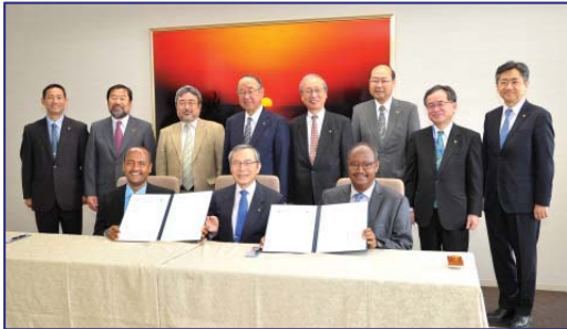
Conclusion of exchange agreements with Injibara University and Bahir Dar University

• Currently, the Faculty of Nursing offers overseas short-term training programs with international exchange partners in South Korea, the US, and the Philippines. In FY2017, 38 students participated in the program, in comparison with the target number of the year of 50 (achieved 76%). So far, 82 graduates out of 160 (51%) have participated in overseas training programs.