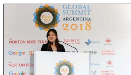
Soka University student took part in the G(irls)20 Global Summit 2018 for the 4th year running