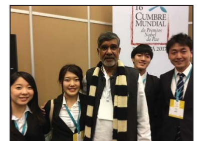
〈With Nobel laureate Mr. Kailash Satyarthi〉

In February 2017, four students attended the World Summit of Nobel Peace Laureates held in Columbia, South America. They had discussions upon challenging topics such as “peace and education” and “peace and sustainable development” with youth representatives, gathered from throughout the world. One of the Soka students had a chance to get involved in making the “Declaration of Youth” and contributed as a presenter.