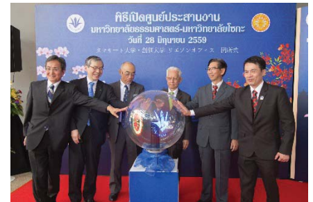
〈Opening of Soka University Thailand Office〉

In FY 2016, total of more than 34,000 students have used the extracurricular programs offered at our learning commons, such as English and other foreign language conversation, writing center, and TOEFL iBT® speaking training, etc. Furthermore, through our unique undergraduate curriculum and various study abroad programs, the number of students who exceed the target language proficiency level of Soka University (equivalent to or higher than TOEFL iBT® 80) increased largely from 296 students at the start of TGU program to 1,035 (13.1% of total students) in FY 2016.