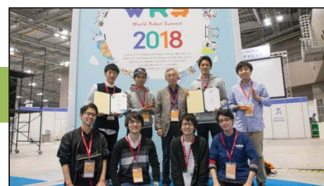
Placed 2nd at World Robot Summit 2018