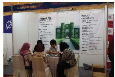
Study in Japan Fair by JASSO

The University decided to call for the participation of administrative staff members in international student recruitment fairs, held both in Japan and overseas, for the purpose of engaging many staff members with international affairs and advance each staff member's competency, regardless of the actual areas of responsibility within the university. The 10 staff members from various offices (except for those regularly involved in work related to international affairs) received pre-event training and took part in the international recruitment fairs to speak directly with prospective international students about the University. As staff members from diverse departments engage with international students, it is expected that each staff member will gain experience dealing with the practical issues relating to the globalization of the University and the support system for accepting international students.