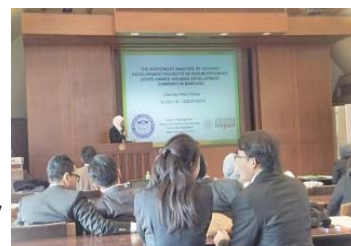
A visit of the student groups from Indonesian partner institutions

As the intellectual contribution to global society by human recourse development, the International Cooperative Graduate Program, which could be entirely completed in English, starts to admit the international students, mainly from Indonesia in September 2016. In the academic year 2015, Master of International Business (MIB) program at the Graduate School of Business opened a new academic specialization called Master of Public Management and Administration (MPMA) and the university examined and prepared the concrete plan for the program curriculum and entrance examination. Moreover, the university signed new partnership agreements with four national universities in Indonesia and now cooperates with the total of six Indonesian institutions of higher education. When the university received a visit of the student groups from partner institutions, the university staff introduced the program curriculum to the visiting students. The entrance examination was conducted during the academic year 2015 and three prospective students are scheduled to be admitted in 2016 at this time.