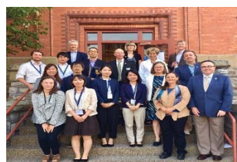
Overseas Training Program for Administrative Staff

Overseas Training Program for Administrative Staff, which has been conducted since 2014, was held in 2017. Six administrative staff participated in this program. After going through intensive off-campus training at International University of Japan, they went to the United States and visited Montana State University and Columbia University, having meetings with faculty and staff.