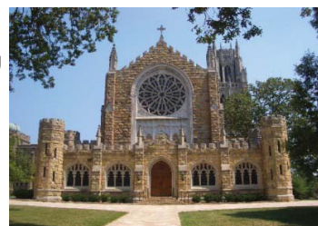
The University of the South (the U.S.) (One of partner institutions for GLAP students)

To prepare for the opening of GLAP scheduled in April 2017, the university has been examining and developing the policies pertaining to curriculum development, entrance examination, new partnerships with overseas institution for required study abroad component, and scholarship funds. Based on the long tradition of Rikkyo University's liberal arts education, GLAP provides the comprehensively packaged academic program, including the liberal arts education conducted in English in small-sized classes, the required study abroad to overseas liberal arts institutions starting in fall semester of second year, and the in-depth specialized education, chosen from the three options of "Humanities," "Citizenship," and "Business," after the students' return to campus. The admitted students are required to live in dormitories with international students for a year and half between their entrance to the university and the departure to study abroad. In the academic year 2016, GLAP Preparatory Office is established and the university continues its efforts to start the admission of the students in the academic year 2017.