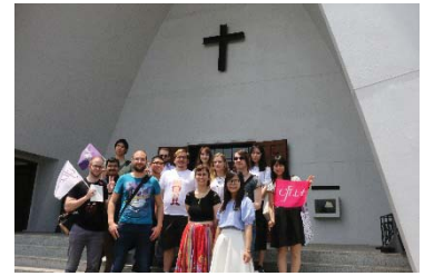
Students enrolled in the short-term intensive Japanese program

Rikkyo University inaugurated the short-term intensive Japanese program in academic year 2016 and received a total of 17 students from the University's partner and prospective partner institutions overseas in the summer (June 2016) and winter (January 2017) intakes. In addition to the student exchange for one semester or whole academic year, the intensive program now offers a new scheme for admitting international students into short-term programs. During the preparation for the program, Niiza campus administration made a number of arrangements in order to welcome the short-term students, including the introduction of bi-lingual menus in student cafeterias and signs around the campus (English and Japanese). Moreover, the program also provided opportunities for domestic students to interact with visiting international students through intercultural programs, including cultural workshops co-organized with student organizations on tea ceremony, flower arrangement and traditional Japanese archery ( kyudo ), as well as working with volunteer student interpreters of RiCoLaS (Rikkyo Community Language Service), organized by the College of Intercultural Communication.