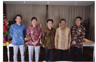
Opening ceremony for the Rikkyo ASEAN office

Due to the networking coordinated by the overseas offices, the University has signed a total of 43 new inter-university and inter-departmental partnership agreements during the academic year 2016. With the opening of the 2 new locations, the University is anticipated to diversify its overseas study options and further develop additional partnership agreements through the effective and efficient promotion of the University in overseas markets, utilizing the connections and resources provided by each liaison office.