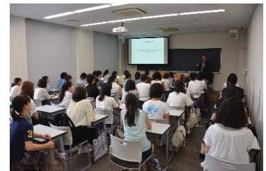
Intensive summer course by the invited professor from Trinity College

Furthermore, the University invited a faculty member from Trinity College (United States), a renowned liberal arts college and one of Rikkyo's exchange partners for the GLAP. The invited professor taught the intensive summer course for 5 days. 17 students, mostly consisting of first and second-year students, were enrolled in the intensive course and it provided an opportunity that was beneficial for the preparation of the GLAP. Moreover, during the annual recruitment event called Open Campus, part of the intensive course was open to visiting high school students to audit and such an experience inspired some of the students to consider applying for the GLAP. It is planned that the University will continue to offer the intensive course in the next academic year and beyond. Since the course was open to the students in all of the existing undergraduate colleges, it could possibly bring the impact of liberal arts education in English to the university-wide level.