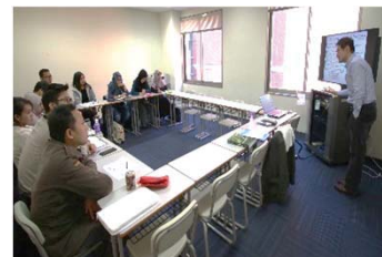
International Cooperative Graduate Program

RU has strengthened its collaboration with Padjadjaran University (PU), one of RU's partnership institutions. RU accepted approximately 80 students from PU in July 2017 and January 2018, conducting one-week seminar, in which they learned business, Japanese culture, and business manner. RU also accepted 30 students from PU in September 2017, organizing the event of cultural exchange, where they performed Indonesian folk music instruments RU's students performed "Wadaiko," or Japanese drum. This event attracted the audience of approximately 100 students, which contributed to reinforce the cultural bridge between RU and PU.