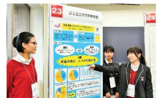
SGH student's poster session