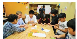
Rikuzentakata Global Campus