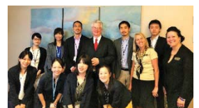
Training Program for Administrative staff

In January 2019, RU hosted international symposium on the theme of accepting regular international students. RU presented our strategic plans and issues to accept more international students. Guest speakers from China, Vietnam, Indonesia, and Russia introduced their own country's educational system of Japanese language education, their high school student's interest in studying abroad in Japan and issues when they study in Japan, where all the participants had a chance to discuss the topics. RU, through this symposium, promoted RU's good practices and support services for international students to the participants from Japan and overseas, also sharing updated information of studying in Japan with all participants.