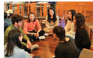
GLAP Meet Up Session

In April 2017, RU and Iwate University (IU) jointly established "Rikuzentakata Global Campus (RTGC)" Rikuzentakata, Iwate Prefecture. RU organized a variety of symposium and student's programs related to reconstruction from the natural disasters including earthquake and tsunami as well as international cooperation. In March 2019, RU organized the symposium related SDGs at RTGC and provided the opportunity to think about sustainable development goals in global and local levels with the participants.