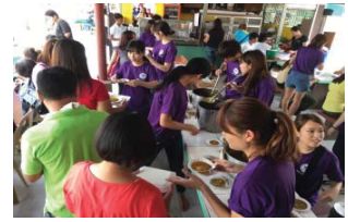
New Study Abroad Program in Philippines

Rikkyo University has become capable of providing a wide variety of study abroad experiences suited for the diverse needs of the students in term of schedule, locations, purpose as well as contents, due to the fact that each college and department has been actively developing new programs. In the academic year 2015, College of Economics launched new programs for its students to learn economics in English at multiple locations, including United Kingdom, Australia and Philippines, with the total participation of 41 students. International Office also started a new short-term English language program in Australia with the total participation of 27 students. Furthermore, Organization for Global Initiatives (OGI) has hired four Education and Research Coordinators for the purpose of assisting the administration of study abroad programs operated by each college and the newly hired coordinators have been able to streamline the operation of study abroad programs effectively by organizing the activities such as information sessions, pre-departure orientations and re-entry meetings. In the academic year 2015, the total number of the participants in international programs has been increased to more than 1,000 students, combining both curricular and extra-curricular programs.