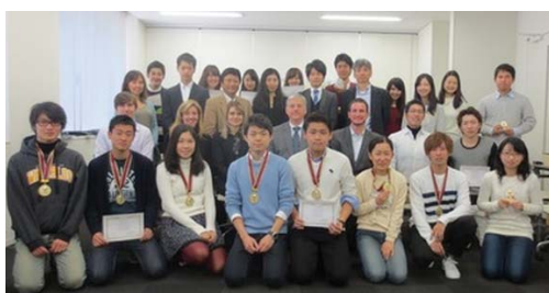
〈Commendation ceremony of the 12 th CLUB900 award in College of Business〉

Starting in the academic year 2016-17, the new university-wide admission procedure will be introduced. Instead of the conventional English test, the score of standardized English proficiency tests (such as GTEC CBT, TEAP, TOEFL and IELTS) will be used to evaluate the applicants' English proficiency in the four skill areas of listening, speaking, reading, and writing. The paper tests will be conducted in two subjects. Rikkyo University decided to introduce the new type of admission in 2014 and has been planning the procedure at the moment.