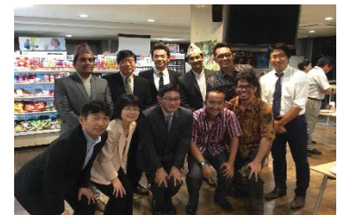
New students and faculty members of the International Cooperative Graduate Program

The International Cooperative Graduate Program is the degree program that offers Master's degree in Public Management and Administration (MPMA) and can be completed entirely with courses offered in English. In the process of promoting the program, it was confirmed that a few other emerging nations, in addition to the original target nation of Indonesia, show interest in the program. Thus, the University decided to expand the targets for the program and include the regular applicants in the entrance examination for Fall 2017 admission and started to accept the applications. In addition, with the opening of the ASEAN liaison office, an efficient administrative system is now in place for the recruitment of the second incoming class, communication with partner institutions and the collection of information on the scholarships offered by local governments and the latest trends within the region in sending the students overseas.