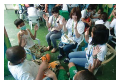
〈Rikkyo Service Learning Program〉