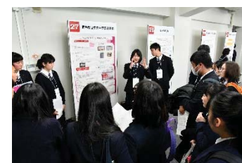
SGH Student Research Presentations

In December 2017, RU held the "Second Annual Contest of SGH Student Research Presentations" for 39 designated schools in the Kanto, Koshinetsu, and Shizuoka Regions selected by MEXT. RU strengthened its ties with them to recruit prospective students who are qualified and motivated to study at RU. 250 students from 19 schools showed up and conducted presentations and poster sessions either in English or Japanese. RU's 10 faculty members and graduate students were present and reviewed their performance.