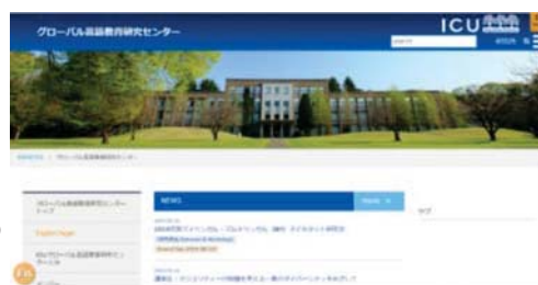
( Website of the Research Center for Global Language Education )

The establishment of the Research Center for Global Language Education has provided the means for language education research such as the development of teaching methods and materials. The Center will also be in charge of improving the "Summer Courses in Japanese", which has been offered at ICU for more than 40 years to returnees and students whose mother tongue is not Japanese. The enhanced language program enables us to accommodate more international students.