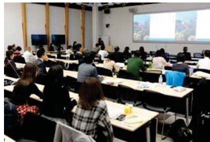
International Service-Learning Conference )

We held an international service-learning conference inviting those in charge of the program at our partner institutions in Japan and abroad. Approximately 100 participants including students from Top Global University Project's universities and related institutions attended. Those in charge of the program from Service-Learning Asia Network (SLAN) partnership universities in 5 countries, related organizations, and domestic NPOs gave lectures, with students presenting their service learning experiences and faculty presenting on "How Service Learning Cultivates Global Citizens." It was an opportunity for faculty from all over Japan, organizations and students to learn about the significance of service learning in education, providing a new perspective for the globalization of universities and students.