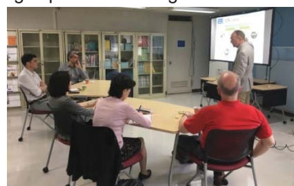
〈New Faculty Development Program〉

Prior to the interim evaluation of the project, we conducted a voluntary external evaluation of this project to acquire objective and concrete results, which we shared with the President, administrative faculty and staff. In September, we appointed a Vice President in charge of International Academic Exchange, adding a foreign national to our decision-making body, to strengthen management.