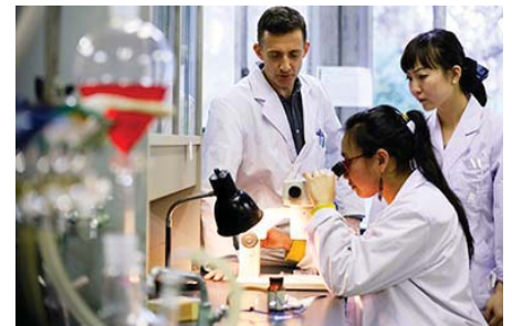
(During a chemistry experiment)

In 2014, a welcome “Meet and Greet” and “Dean’s Reception” organized by the April and September upper class students were held for new September students. This event not only promoted interaction between the two groups of students, but also served as an orientation for other student-run events and short-trip to facilitate April and September students’ communication.