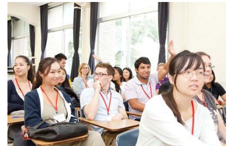
(During a “Meet and Greet” session)

In order to provide the opportunity to strengthen the necessary academic Japanese skills for the ELA (English for Liberal Arts program) Stream* 1 and 2 April students whose English score is above IETLS 6.5, a JLP (Japanese Language Program) Placement Test will be conducted during 2015. These students would be able to take the Japanese language courses which originally were designed for September students only. *Class levels divided into Streams 1 to 4.