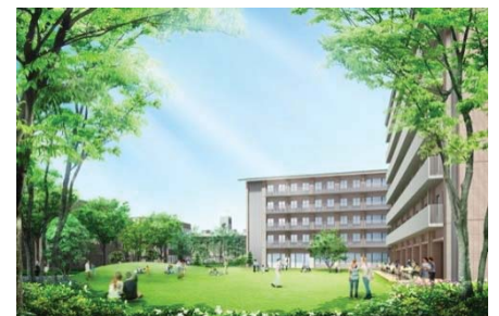
〈Image - New Student Dormitories〉

At ICU, foreign language instruction has featured mostly Western languages, Chinese and Korean. In FY2015, we started offering Arabic and Indonesian. Twenty seven (quota: 30) students took the introductory course in Arabic and 45, in Indonesian. Instruction in a second foreign language is now offered in nine languages, expanding the opportunity for students to choose from a diverse range of languages.