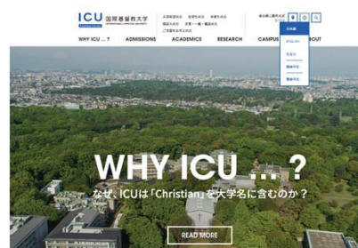
〈 Official University Website providing basic information about the university in multiple languages 〉

As a measure to publicize educational information thoroughly, we revised the English used on our website when we renewed the formal university website. We also predict the increase of Korean and Chinese applicants based on the universal admission system in this project, so we also added Chinese and Korean versions on our website. The Job Consultation Group website is now bilingual. This has enabled us to provide accurate information about the university from application to seeking a path after graduation in multiple languages including English.