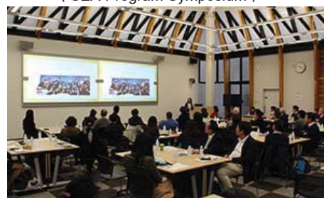
〈 SEA Program Symposium 〉

We invited 13 staff members to ICU from our Study English Abroad (SEA) Program host institutions, to participate in a workshop and an open symposium. During the workshop, participants observed the English for Liberal Arts (ELA) classes, talked with faculty in charge, and confirmed the coordination between the ELA and SEA program. At the symposium, we introduced the characteristics of programs offered at each host institution, with details about our study abroad program and students' reports about their experiences. It was an opportunity to showcase the outcome of our study abroad program tailored to diverse student needs and language backgrounds.