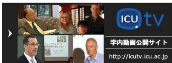
〈 ICU-TV site 〉

Open Courseware (OCW) which provides content and notes of lectures online increased to 164 as of December 2017. ICU-TV, which is only available on campus and can be used for prior study and revision, will amount to 273 courses by the end of AY2017. Students have benefited from use of ICU-TV when studying on their own.