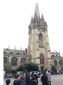
〈 Staff training in the U.K University of Oxford 〉

1) We sent a physics major student to the College of Wooster in the U.S. 2) We chose the first student for the undergraduate and master's 5-year program with the Middlebury Institute of International Studies at Monterey (MIIS) in the U.S., initiating in January 2018. 3) With support from the international consortium Global Liberal Arts Alliance (GLAA) we were able to send a student to the Athens Democracy Forum organized by the New York Times. 4) Outbound students from ICU reached 141 in 2017, the highest in the last ten years.