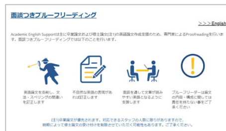
〈 Proofreading notice for students 〉

We continued to employ English proofreaders to support students writing their senior thesis in English, in fulfilling services to achieve our distinct goal in enhancing senior thesis writing ability in English. A total of 40 students used the proofreading service 191 times. The ratio of senior thesis written in English was 35%, the same as in AY2016.