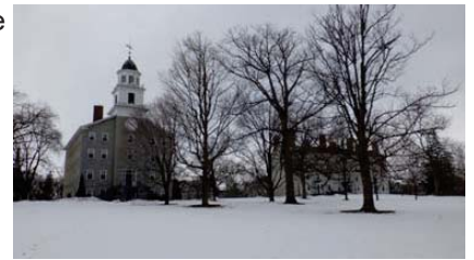
〈 Faculty & Staff training in the U.S Middlebury College 〉

1) We accepted one student (double major in mathematics and history) from the College of Wooster in the U.S. and sent two students there (biology major). 2) We sent one student to the Accelerated Entry Program in the MA Translation and Interpretation Program at the Middlebury Institute of International Studies at Monterey (MIIS) in the U.S., as we did last year. 3) We sent one student to the "Leadership and Liberal Arts: A Foundation For Social Good" held at Flame University in India with support from the Global Liberal Arts Alliance (GLAA). We also sent a student to the New York Times Athens Democracy Forum, as we did last year. 4) We signed partnership agreements with Hong Kong Baptist University and Bratislava International School of Liberal Arts (BISLA), a GLAA member in Slovakia. We now have 74 partnership schools in 24 countries and regions. 5) In our international service learning program, we sent four students to Kenya through the GLM Institute, a non-profit organization.