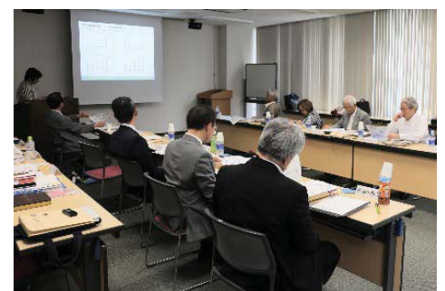
〈 During the Q&A session 〉