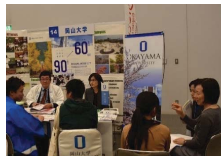
〈 Discovery Program for Global Learners' public relations activity for the 3rd GO Global Japan Expo 〉

We joined study abroad events and visited overseas high schools for public relations and recruitment activities. Moreover, we kept track of overseas demand for manpower and necessary expertise and skills. Furthermore, we developed curriculums for training personnel with practical skills that will have high educational effects and match the needs of students and society, and an entrance examination system for selecting applicants who are qualified for the program.