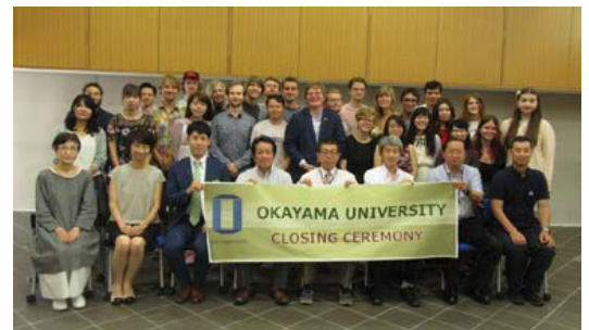
〈 Presentation Session and Program Completion Ceremony 〉