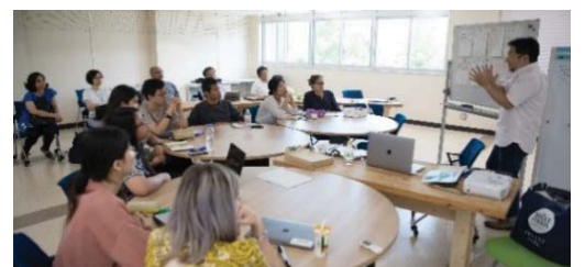
〈 SiEED Program experimental class 〉