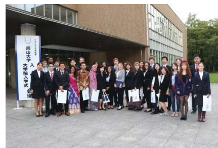
〈 The first batch of students in the Discovery Program for Global Learners in front of the entrance ceremony venue 〉

After further discussion on how to operate the graduate school, we set up seven working sections and working groups under the New Graduate School Establishment Preparation Committee. Thus, we prepared thoroughly for the establishment of the graduate school in April 2018, discussing an enormous amount of issues, including how to build an operating structure for the new graduate school, how to implement public relations activities through the university's website or other means, how to design systems for educational affairs, entrance examinations, and student life, and how to develop practical training programs in advanced hospitals.