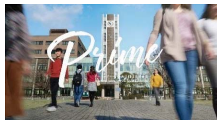
〈 Top page of the website of the Top Global University project 〉