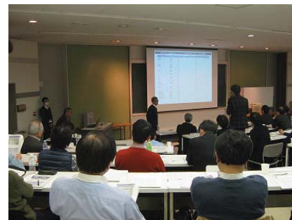
〈 Training camp session for department heads and others 〉

In addition to the Department Heads Training Session which is held annually, the Faculty of Engineering held a training workshop for teachers to improve their minds for university reforms.