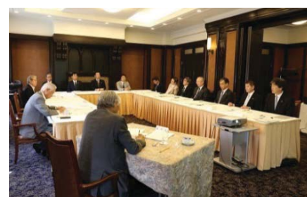
〈 Meeting of the external evaluation committee 〉

Moreover, we will hold a Graduate School of Medical and Health Sciences Integrated with Humanity and Technology (provisional name) workshop in academic year 2016.