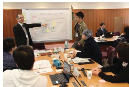
〈 Okayama University Future Session 1-1 〉

Under the theme "Future State of Okayama University—Focusing on the enhancement of Graduate Schools," 31 young faculty members from each faculty/school were divided into four groups to discuss and give a presentation on realistic problem-solving plans and ideas for creating a bright future for the university.