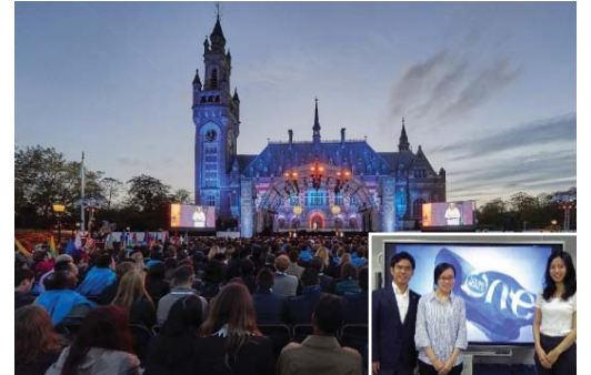
〈 An opening ceremony was held at The Hague, the Netherlands 〉