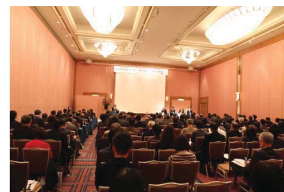
〈 Symposium for collaboration between the industry, government and university 〉

We also drew up a draft definition of the practical social collaborative education program, decided test subjects to be implemented in academic year 2015 and compiled a draft plan for subjects to be taught in academic year 2016. In the future, we will examine all subjects based on results of self-monitoring on the program, and fully introduce it in academic year 2016.