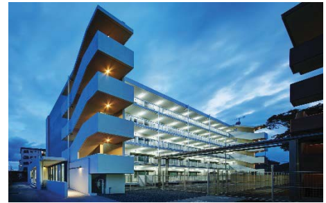
International Student Shared House

In March 2016, a shared house, where 120 students (30 Japanese students and 90 international students) can live together, was completed. Living together with other students may improve mutual cultural understanding, cooperation, and learning from each other. This shared house is expected to be a place that may increase students' motivation in language learning and encourage international exchange and studying abroad.