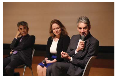
〈 At a panel discussion held at the symposium commemorating the establishment of the Discovery Program for Global Learners 〉

Furthermore, we received request statements indicating the importance and necessity of establishing the graduate school, not only from Okayama City and the Okayama Association of Corporate Executives, but also from the city of San Jose, California and the Japan Business Society of Detroit, Michigan, both in the U.S. In March 2017, we submitted our establishment planning documents, together with these request statements, to the Ministry of Education, Culture, Sports, Science and Technology.