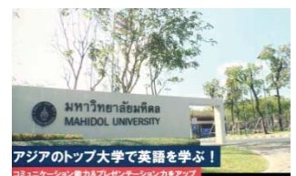
<Study Program PR Video in Mahidol>

The 6 national universities alliance of SixERS (Six National Universities International Education and Research System (Niigata, Chiba, Kanazawa, Okayama, Nagasaki, and Kumamoto), which started in FY 2014, has established a coalition with AUN (ASEAN University Network) and opened a joint office with Northeast Normal University (Changchun, China). We will cooperate with domestic universities through various alliances and aim to establish partnerships with overseas alliances.