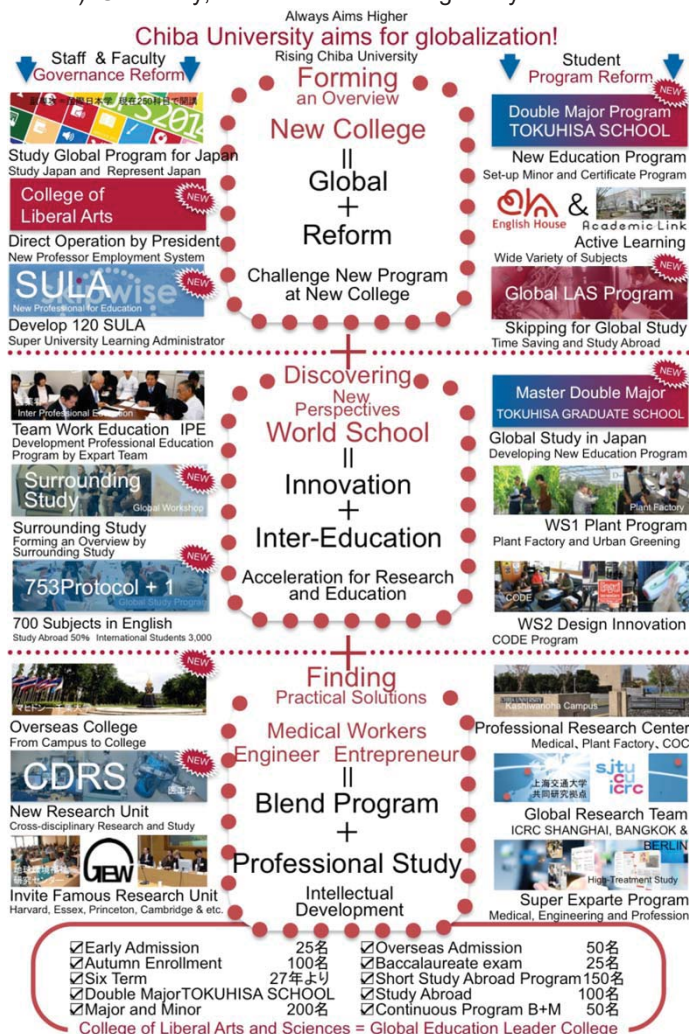
( Fig 1 Outline of Project )

This project aim is to undertake a reform of Chiba University by providing tailor-made education to domestic and overseas students in the new College of Liberal Arts. To do so, we are committed to governance reform, learning system reform and program reform, while carrying out a global network reform, with the goal of opening an extension campus overseas. Above all, Chiba University will introduce a unique program called International Liberal Arts, which is a new early admission system for allowing students to save time by gaining early admission in order to utilize that time for overseas study. For this program, we will create new positions with the title of SULAs (Super University Learning Administrators), who will promote the tailor-made education created to support this program. Ad well as this, we will carry out integrated programs at the postgraduate level for “discovering new perspectives”, and establish various study units for “finding practical solutions”, in order to foster expert, globally-aligned human resources. For this purpose, we have set the following goals: to offer over 700 liberal arts subjects taught in English; to annually send 1200 students, accounting for 50% of one undergraduate year, overseas to study; to accept 3000 overseas students per year; and to enroll 120 students through special entrance examinations per year, (10% of the annual intake). Ultimately, we aim to become a globally-oriented university.