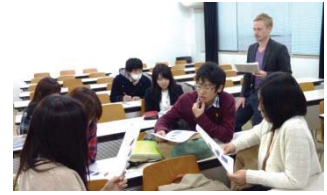
〈English Communication Class〉

We have employed 12 lecturers so far for conducting the globalization-related programs. The programs are wide-ranging, from Japanese culture/subculture to English communication. We have also increased the number of our liberal art subjects taught in English.