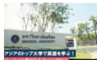
<Study Program PR Video in Mahidol>

The 6 national universities alliance of SixERS (Six National Universities International Education and Research System (Niigata, Chiba, Kanazawa, Okayama, Nagasaki, and Kumamoto), which started in 2014, has established a coalition with AUN (ASEAN University Network) and opened a joint office with Northeast Normal University (Changchun, China). We will cooperate with domestic universities through various alliances and aim to establish partnerships with overseas alliances.