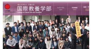
〈CLAS 's Website〉

Based on the “International Japan Studies program for major subjects (minor subject)”, which is a unique facet of Chiba University, we established a new College in spring 2016, in which, arts and sciences are integrated, so that students will study “Global studies”, “Japan studies” and “Sciences” in combination. This will push forward our goal for globalization. The newly formed college will be the driving force for the new education system of Chiba University, including fostering global human resources.