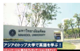
<Study Program PR Video in Mahidol>

The 6 national universities alliance of SixERS (Six National Universities International Education and Research System (Niigata, Chiba, Kanazawa, Okayama, Nagasaki, and Kumamoto) has established a coalition with AUN (ASEAN University Network) and opened a joint office with Northeast Normal University (Changchun, China). We will cooperate with domestic universities through various alliances and aim to establish partnerships with potential future overseas alliances.