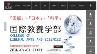
〈Announcement of CLAS on Website〉

Based on the “International Japan Studies program for major subjects (minor subject)”, which is a unique facet of Chiba university, we will establish a new College in which arts and sciences are integrated, so that students will study “Global studies”, “Japan studies” and “Sciences” in combination, thereby pushing forward our goal of globalization. The newly formed college will be the driving force for the new education system of Chiba university, including fostering global human resources. Preparation for its inauguration in 2016 has been completed.