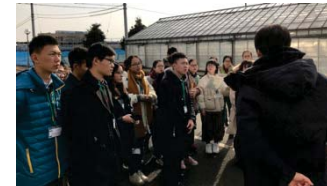
〈Food Safety : Short Program〉

We carried out 13 short programs and accepted approximately 300 overseas students in FY 2018. We distributed our pamphlets to our partner universities and made PR videos for a campaign. In addition, plans for term-long programs (for 2 months) and other programs are under consideration. These programs promote coeducation of overseas and Japanese students, thereby pushing forward our domestic globalization programs.