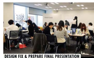
〈Short Program PR Video〉

We have developed and carried out two experimental short programs. In FY 2016, we distributed our pamphlets to our partner universities and we will start 13 programs. In addition, plans for term-long programs (for 2 months) and other programs are under consideration. A video for a PR campaign for the programs has been made. These programs promote coeducation of overseas and Japanese students, thereby pushing forward our domestic globalization programs.