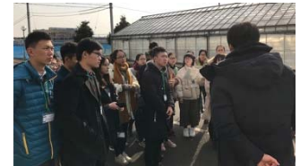
〈Food Safety : Short Program〉

We carried out 7 short programs and accepted approximately 200 overseas students in FY 2017. We distributed our pamphlets to our partner universities and made PR videos for a campaign. In addition, plans for term-long programs (for 2 months) and other programs are under consideration. These programs promote coeducation of overseas and Japanese students, thereby pushing forward our domestic globalization programs.