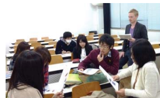
〈English Communication Class〉

We have employed 12 lecturers so far for conducting the globalization-related programs. The programs are wide-ranging, from Japanese culture/subculture to English communication. We have also increased the number of our liberal art subjects taught in English.