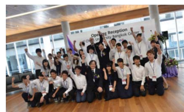
<Bangkok Campus Opening Ceremony>