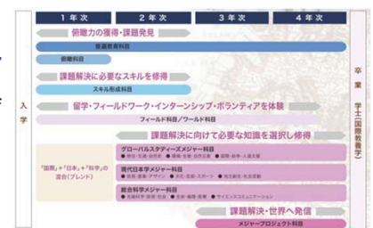
〈CLAS 's Curriculum Construction〉

Based on the minor program called “International Japan Studies”, which is a unique facet of Chiba University, we established a new College in spring 2016, in which, arts and sciences are integrated, so that students will study “Global studies”, “Japan studies” and “Sciences” in combination. This will push forward our goal for globalization. The newly formed college will be the driving force for the new education system of Chiba University, including fostering global human resources.