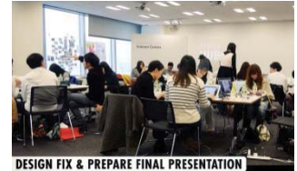
〈Short Program PR Video〉

We have developed and carried out two experimental short programs. In addition, plans for term-long programs (for 2 months) and other programs are under consideration. A video for a PR campaign for the programs has been made. These programs promote coeducation of overseas and Japanese students, thereby pushing forward our domestic globalization programs.