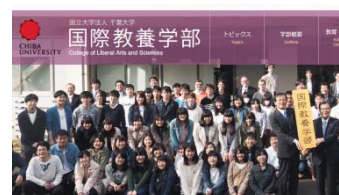
〈CLAS 's Website〉

Based on the “International Japan Studies program for major subjects (minor subject)”, which is a unique facet of Chiba University, we established a new College in spring 2016., in which, arts and sciences are integrated, so that students will study “Global studies”, “Japan studies” and “Sciences” in combination. This will push forward our goal of globalization. The newly formed college will be the driving force for the new education system of Chiba University, including fostering global human resources.