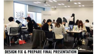
〈Short Program PR Video〉

Number of Coeducation Programs with Japanese Students we carried out 13 short programs and accept 300 overseas students in FY 2016. We distributed our pamphlets to our partner universities and made PR videos for a campaign. In addition, plans for term-long programs (for 2 months) and other programs are under consideration. These programs promote coeducation of overseas and Japanese students, thereby pushing forward our domestic globalization programs.