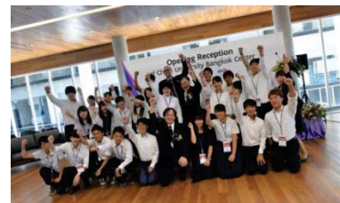
<Bangkok Campus Opening Ceremony >