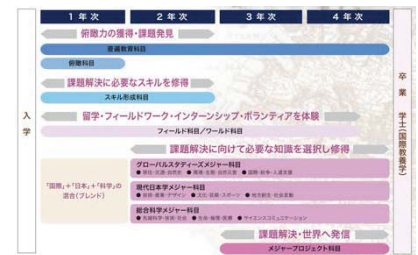
〈CLAS 's Curriculum Construction〉

Study abroad will be compulsory for all students entering the university from 2020. This initiative is named the ENGINE program, and global education will be promoted along with integrative education of the arts and the sciences.