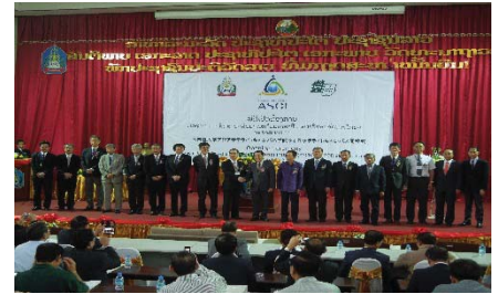
〈 Opening ceremony of Asian Satellite Campuses in Laos 〉