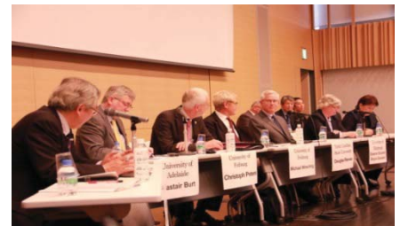
〈 A Commemorative Symposium on October, 2015 〉