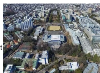
< Current conditions >

These initiatives received favorable evaluation and were awarded the first MEXT Infra-maintenance award established by MLIT, MIC, MEXT, MHLW, MAFF, and MOD.