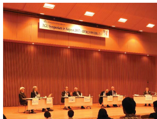
<International Symposium on Feb 17, 2017>

On February 17, 2017, the University hosted an international symposium to recognize and share the results of the efforts made for these programs during the previous two and a half years, inviting an International Advisory Board composed of former university presidents. The members shared many valuable opinions and words of encouragement directed at the programs, such as: "The University's aspirations and strategies in implementing these programs are all outstanding. I can see the university has already been making significant progress, and it seems you are proceeding in the right direction. I would like to give you all a big round of applause."; "These joint degree programs will not only result in doctoral degree conferment, but I expect the university will be able to enhance both the quantity and quality of research collaboration with overseas universities, and create a cycle for improving the quality of research papers, promoting education and research funding, and attracting talents."