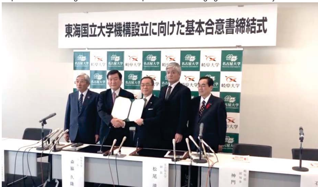
<State of the ceremony>

In an effort to contribute to society by delivering world-class education and research and in order to become a world leading research university, the university has formulated a “shared governance” plan, a collaborative system for sharing information, objectives, and strategies between the board of trustees, graduate school executives, faculty and staff members of the university, launched several working groups, and started creating concrete plans. Through this system, the university fosters an environment of reliance and responsibility and is able to implement a form of governance that responds to the changing needs of society in a more flexible way.