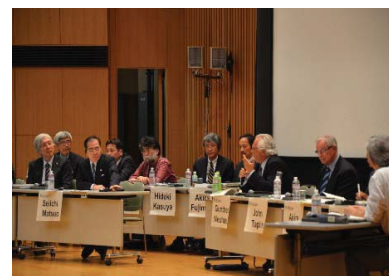
<President and directors listening to IAB>

We held a symposium in May 13, 2015 for all faculty members to share information and better understand our strategies and goals for becoming a leading university in the world. Each member in charge fully explained each strategy and action plan (strategies to implement in 2015-2017), and over 550 members attended the symposium. We also invited 4 members from the International Advisory Board (IAB), including foreign teachers, and had a panel discussion about our strategies and their problems with the president and department directors. The symposium was successful to the point that it was necessary to extend the time due to the large number of questions.