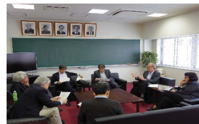
<Discussion on Intercontinental Academia at NU>

UBIAS (University-Based Institutes for Advanced Studies) is an organization that aims to promote a network between national institutes of advanced studies of universities around the world and stimulate international research exchange. Currently, Nagoya University is playing a central role in the planning and operations of the "Intercontinental Academia" project which seeks to nurture leaders of the next generation in collaboration with the University of São Paulo Institute of Advanced Studies. A workshop was held at the University of São Paulo in April 2015 and the next workshop is planned at Nagoya University in March 2016. Nagoya University and the University of São Paulo have discussed, during 2014, the contents and management of the program, and how to recruit applicant over the internet.