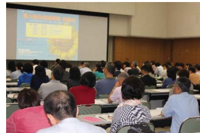
<Orientation on Savings Accounts system for studying abroad>

Savings Account system, in which students interested in studying abroad save 10 thousand yen a month, was established in 2015. In case the deposit is not enough for studying abroad, he/she can borrow the necessary amount from the university's loan system without interest. Over 200 people attended the orientation held for parents and guardians in May 2015. This system began in 2015 and we estimate that about 400 students will have utilized this system by 2017.