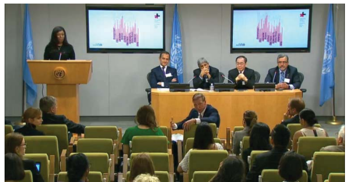
< HeForShe IMPACT 10 × 10 × 10 University Parity Report >