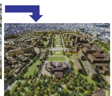
< Thirty years later >