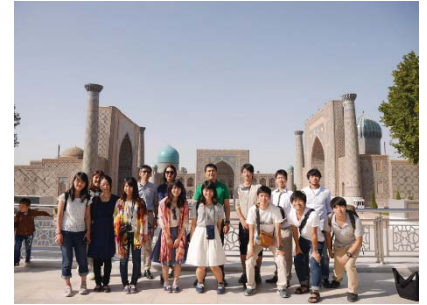
〈 Overseas study tour in Uzbekistan 〉

In 2015, programs consisting of coursework both inside Japan and overseas were opened as Liberal Arts and Sciences courses (4 Liberal Education Courses in Interdisciplinary Fields, 3 Literary and Cultural Studies). To take the 4 Liberal Education Courses in Interdisciplinary Fields for example, they were designed to each consist of clear and unique content and implemented with the expansion of the program (USA, Uzbekistan, Thailand, UK). Participants were able to achieve objectives such as experiencing the global expansion of the place of learning (USA) and acquiring the fundamental attitude towards future academic research (Uzbekistan, Thailand, UK). These achievements have been shared both internally and publicly through publications or oral presentations, etc. 101 students participated in NU-OTI courses in 2015, and the total number of students dispatched from Nagoya University this year reached 1,013 (Last year, 605).