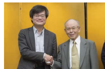
<Distinguished Professor Akasaki (right) and Distinguished Professor Amano (left)>

Nagoya University has strived to promote an energy saving society since Distinguished Professor Akasaki and Distinguished Professor Amano were awarded a Nobel Prize in 2014. We have also taken the initiative to work towards the establishment of the GaN (Gallium Nitride) Consortium within 2015, in which public and private sectors jointly conduct research for the GaN crystal growth, GaN-based device development, and the organization of a research system. This effort attracts a great deal of interest and 40 organizations, including over 20 companies, participated in the discussion meeting for the GaN Consortium establishment.