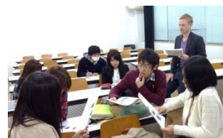
〈English Communication Class〉

We have employed 12 lecturers so far for conducting the globalization-related programs. The programs are wide-ranging, from Japanese culture/subculture to English communication. We have also increased the number of our liberal art subjects taught in English.