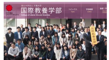
〈CLAS 's Website〉

Based on the “International Japan Studies program for major subjects (minor subject)”, which is a unique facet of Chiba University, we established a new College in spring 2016, in which, arts and sciences are integrated, so that students will study “Global studies”, “Japan studies” and “Sciences” in combination. This will push forward our goal for globalization. The newly formed college will be the driving force for the new education system of Chiba University, including fostering global human resources.