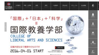
〈Announcement of CLAS on Website〉

Based on the “International Japan Studies program for major subjects (minor subject)”, which is a unique facet of Chiba university, we will establish a new College in which arts and sciences are integrated, so that students will study “Global studies”, “Japan studies” and “Sciences” in combination, thereby pushing forward our goal of globalization. The newly formed college will be the driving force for the new education system of Chiba university, including fostering global human resources. Preparation for its inauguration in 2016 has been completed.