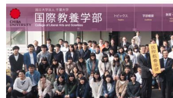
〈CLAS 's Website〉

Based on the “International Japan Studies program for major subjects (minor subject)”, which is a unique facet of Chiba University, we established a new College in spring 2016., in which, arts and sciences are integrated, so that students will study “Global studies”, “Japan studies” and “Sciences” in combination. This will push forward our goal of globalization. The newly formed college will be the driving force for the new education system of Chiba University, including fostering global human resources.