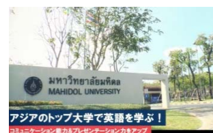
<Study Program PR Video in Mahidol>

The 6 national universities alliance of SixERS (Six National Universities International Education and Research System (Niigata, Chiba, Kanazawa, Okayama, Nagasaki, and Kumamoto) has established a coalition with AUN (ASEAN University Network) and opened a joint office with Northeast Normal University (Changchun, China). We will cooperate with domestic universities through various alliances and aim to establish partnerships with potential future overseas alliances.