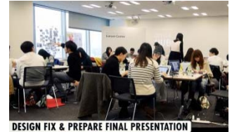
DESIGN FIX & PREPARE FINAL PRESENTATION 〈Short Program PR Video〉

Number of Coeducation Programs with Japanese Students we carried out 13 short programs and accept 300 overseas students in FY 2016. We distributed our pamphlets to our partner universities and made PR videos for a campaign. In addition, plans for term-long programs (for 2 months) and other programs are under consideration. These programs promote coeducation of overseas and Japanese students, thereby pushing forward our domestic globalization programs.