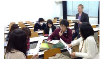
〈English Communication Class〉

We have employed 12 lecturers so far for conducting the globalization-related programs. The programs are wide-ranging, from Japanese culture/subculture to English communication. We have also increased the number of our liberal art subjects taught in English.