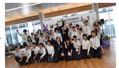
〈Bangkok Campus Opening Ceremony〉

The 6 national universities alliance of SixERS (Six National Universities International Education and Research System (Niigata, Chiba, Kanazawa, Okayama, Nagasaki, and Kumamoto) has established a coalition with AUN (ASEAN University Network) and opened a joint office with Northeast Normal University (Changchun, China). We will cooperate with domestic universities through various alliances and aim to establish partnerships with potential future overseas alliances.