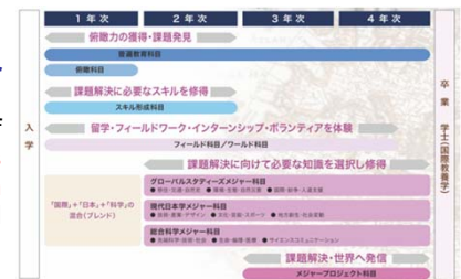
〈CLAS 's Curriculum Construction〉

Based on the minor program called “International Japan Studies”, which is a unique facet of Chiba University, we established a new College in spring 2016, in which, arts and sciences are integrated, so that students will study “Global studies”, “Japan studies” and “Sciences” in combination. This will push forward our goal for globalization. The newly formed college will be the driving force for the new education system of Chiba University, including fostering global human resources.