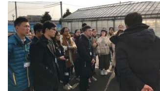
〈Food Safety : Short Program〉

We carried out 7 short programs and accepted approximately 200 overseas students in FY 2017. We distributed our pamphlets to our partner universities and made PR videos for a campaign. In addition, plans for term-long programs (for 2 months) and other programs are under consideration. These programs promote coeducation of overseas and Japanese students, thereby pushing forward our domestic globalization programs.