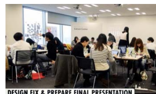
〈Short Program PR Video〉

We have developed and carried out two experimental short programs. In FY 2016, we distributed our pamphlets to our partner universities and we will start 13 programs. In addition, plans for term-long programs (for 2 months) and other programs are under consideration. A video for a PR campaign for the programs has been made. These programs promote coeducation of overseas and Japanese students, thereby pushing forward our domestic globalization programs.