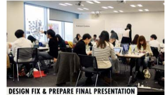
〈Short Program PR Video〉

We have developed and carried out two experimental short programs. In addition, plans for term-long programs (for 2 months) and other programs are under consideration. A video for a PR campaign for the programs has been made. These programs promote coeducation of overseas and Japanese students, thereby pushing forward our domestic globalization programs.