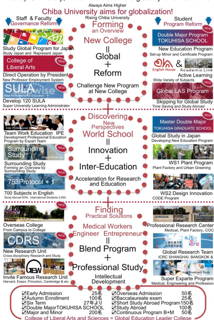
( Fig 1 Outline of Project )

This project aim is to undertake a reform of Chiba University by providing tailor-made education to domestic and overseas students in the new College of Liberal Arts. To do so, we are committed to governance reform, learning system reform and program reform, while carrying out a global network reform, with the goal of opening an extension campus overseas. Above all, Chiba University will introduce a unique program called International Liberal Arts, which is a new early admission system for allowing students to save time by gaining early admission in order to utilize that time for overseas study. For this program, we will create new positions with the title of SULAs (Super University Learning Administrators), who will promote the tailor-made education created to support this program. Ad well as this, we will carry out integrated programs at the postgraduate level for “discovering new perspectives”, and establish various study units for “finding practical solutions”, in order to foster expert, globally-aligned human resources. For this purpose, we have set the following goals: to offer over 700 liberal arts subjects taught in English; to annually send 1200 students, accounting for 50% of one undergraduate year, overseas to study; to accept 3000 overseas students per year; and to enroll 120 students through special entrance examinations per year, (10% of the annual intake). Ultimately, we aim to become a globally-oriented university.