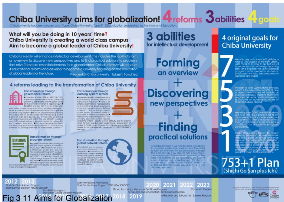
Fig 3 11 Aims for Globalization

In the global network reform, we will conduct two major activities: establishment of an overseas campus and interaction among the group of universities affiliated with Chiba University. We will open an overseas campus at Mahidol University in Thailand. The overseas campus will offer experience-type short-term study abroad (training studio) programs, professional education programs, Off-Shore programs, double-degree programs, and joint-degree programs for undergraduate students, and provide international joint research labs (horticultural science, bioscience).