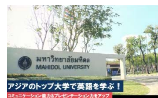
<Study Program PR Video in Mahidol>

The 6 national universities alliance of SixERS (Six National Universities International Education and Research System (Niigata, Chiba, Kanazawa, Okayama, Nagasaki, and Kumamoto), which started in 2014, has established a coalition with AUN (ASEAN University Network) and opened a joint office with Northeast Normal University (Changchun, China). We will cooperate with domestic universities through various alliances and aim to establish partnerships with overseas alliances.