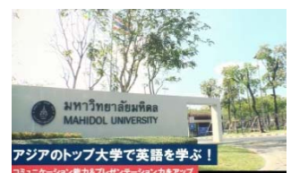
<Study Program PR Video in Mahidol>

The 6 national universities alliance of SixERS (Six National Universities International Education and Research System (Niigata, Chiba, Kanazawa, Okayama, Nagasaki, and Kumamoto), which started in FY 2014, has established a coalition with AUN (ASEAN University Network) and opened a joint office with Northeast Normal University (Changchun, China). We will cooperate with domestic universities through various alliances and aim to establish partnerships with overseas alliances.