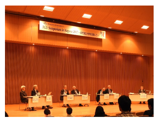
<International Symposium on Feb 17, 2017>

On February 17, 2017, the University hosted an international symposium to recognize and share the results of the efforts made for these programs during the previous two and a half years, inviting an International Advisory Board composed of former university presidents. The members shared many valuable opinions and words of encouragement directed at the programs, such as: "The University's aspirations and strategies in implementing these programs are all outstanding. I can see the university has already been making significant progress, and it seems you are proceeding in the right direction. I would like to give you all a big round of applause."; "These joint degree programs will not only result in doctoral degree conferment, but I expect the university will be able to enhance both the quantity and quality of research collaboration with overseas universities, and create a cycle for improving the quality of research papers, promoting education and research funding, and attracting talents."