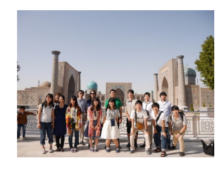
〈 Overseas study tour in Uzbekistan 〉

In 2015, programs consisting of coursework both inside Japan and overseas were opened as Liberal Arts and Sciences courses (4 Liberal Education Courses in Interdisciplinary Fields, 3 Literary and Cultural Studies). To take the 4 Liberal Education Courses in Interdisciplinary Fields for example, they were designed to each consist of clear and unique content and implemented with the expansion of the program (USA, Uzbekistan, Thailand, UK). Participants were able to achieve objectives such as experiencing the global expansion of the place of learning (USA) and acquiring the fundamental attitude towards future academic research (Uzbekistan, Thailand, UK). These achievements have been shared both internally and publicly through publications or oral presentations, etc. 101 students participated in NU-OTI courses in 2015, and the total number of students dispatched from Nagoya University this year reached 1,013 (Last year, 605).