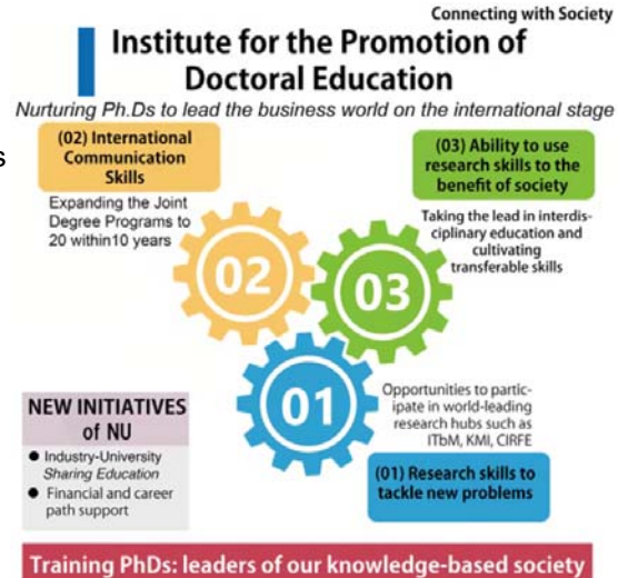
<Role of Institute for the Promotion of Doctoral Education>

We hope to conduct postgraduate education that stands out to researchers and students worldwide through the activities of these organizations.