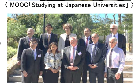
(IARU Presidents' Meeting at ANU 2017)

UTokyo participated in events such as the Presidents' Meeting of IARU (International Alliance of Research Universities), AEARU (Association of East Asian Research Universities), Sino-Japan Presidents' Meeting, and the Japan-Mexico Presidents' Meeting, through which we increased our reputation and presence on the world stage. In 2017, we worked with the AUA (Asian University Alliance), which is made up of 15 of the premier higher learning institutions in Asia, to begin promoting joint student exchange programs and the strengthening of links between universities in Asia.