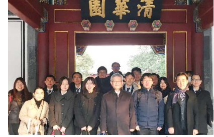
(Staff Training in China)

The meeting of the President's Council was held in November 2016, with 15 experts from around the world being invited, and exchanged their views and opinions about the visions and policies of our university. In order to establish the new UTokyo Global Advisory Board, we have requested the candidates recommended by each department to join as new council members, in addition to the existing members of the President's Council. Also, we have formalized new internal regulations to create the board in the Office of the President as a committee which is defined in the University of Tokyo Rules on Basic Organizations.