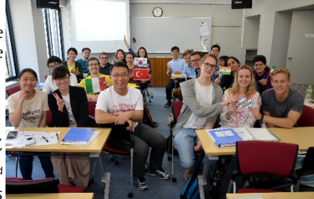
⟨ Japanese Class Students ⟩

In addition to the "PEAK" courses where students can obtain a degree solely using English, established in the College of Arts and Sciences, in April 2014the "Global Science Course" was established in the School of Sciences. Students are admitted by transferring into the 3<sup>rd</sup> year. Such university-wide initiatives to increase the number of classes in foreign languages are thought to contribute towards international student mobility.