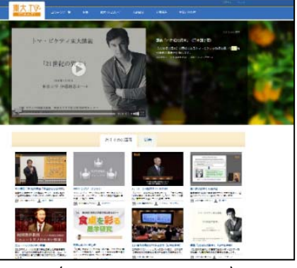
⟨ UTokyo TV Top Page ⟩

UTokyo has been providing platforms such as UTokyo iTunes, UTokyo TV, UTokyo OCW in order to disseminate information to all first year students each year. The platforms above had already steered awareness towards online and allowed a smooth shift to MOOCs for open online courses. The access quantity in 2015 dramatically increased by 261% compared to that of the previous year.