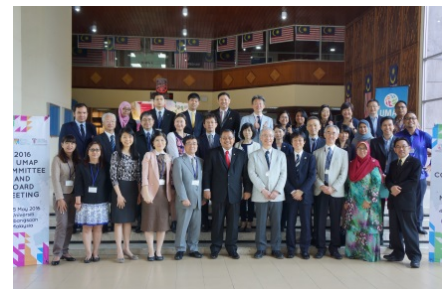
<UMAP Board Meeting>

We undertook International Secretariat of UMAP (University Mobility in Asia and the Pacific) from January FY2016 for five consecutive years. This will contribute to promoting flexible international student transfers in the higher education level within the Asia-Pacific region. In recognition of the importance of increasing numbers of participating countries / regions in revitalizing student exchanges, we are preparing to review the exchange scheme to encourage more students in Japan to go study abroad through UMAP.