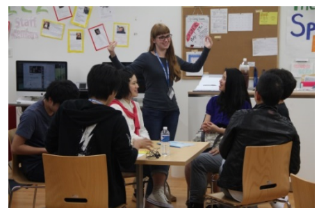
<International Communication Space>

"Diversity Voyage", an overseas training program in which students make a solution through a fieldwork project out-side of Japan, has been held. Many students have joined this program even though they had rarely been abroad (there were 117 students from all faculties who went to Thailand, the Philippines, Malaysia, and Laos in FY2015 through this program) and have been engaged in international activities in and outside of Japan.