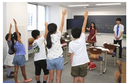
<Toyo Achieve English>