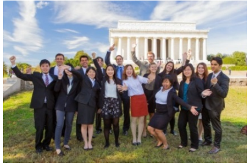
〈The Washington Center〉