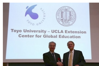
< Alliance with UCLA Extension >

"Toyo - UCLA Extension Center" will provide the BEC (Business English Communication) Program. Also, Toyo University students will be able to take the course "Business English" from the 2015 academic year as a standard undergraduate course. This course uses the same curriculum as the UCLA Extension Center's BEC program, allowing students to continue extra-curricular studies to receive certification from the UCLA Extension Center. Going forward, there will also be global education opportunities held for all generations, from elementary school students to senior citizens, as we will plan and operate English programs for preschool, elementary, junior high, and high school students and senior citizens, study abroad support programs, and summer overseas study trips.