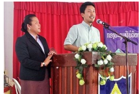
<The Tobitate program>

In the 2013 academic year, 155 students achieved the target score, and in the 2014 academic year, that number increased to 288. We are also expanding the quality and quantity of our extra-curricular programs, hiring 15 native English-speaking instructors to improve the level of teaching of the 4 language skills, as well as expanding our IELTS preparatory course lineup.