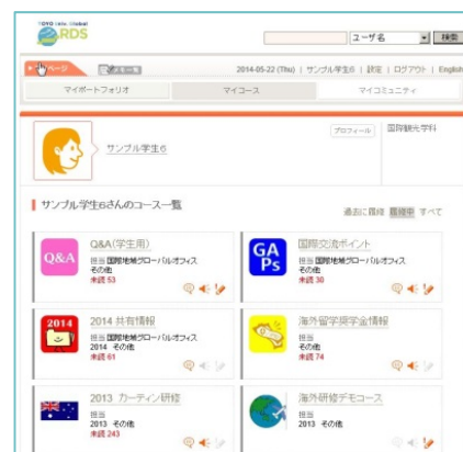
< Visualization of Learning Outcome through E-portfolio >

Through the Toyo University - UCLA Extension Center for Global Education, joint courses will be developed for all generations for a total of 500 courses and 10,000 participants by 2023.