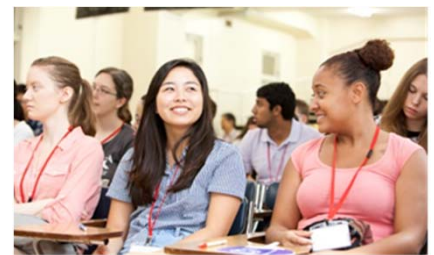
〈September Retreat for New Students〉

In preparation for introducing Universal Admissions, we compiled a plan for the establishment of the Global Language Center to link support in learning with language programs.