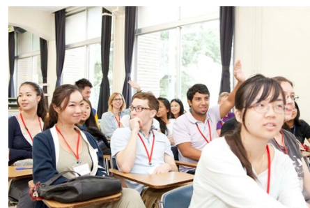
(During a “Meet and Greet” session)

In order to provide the opportunity to strengthen the necessary academic Japanese skills for the ELA (English for Liberal Arts program) Stream* 1 and 2 April students whose English score is above IETLS 6.5, a JLP (Japanese Language Program) Placement Test will be conducted during 2015. These students would be able to take the Japanese language courses which originally were designed for September students only. *Class levels divided into Streams 1 to 4.