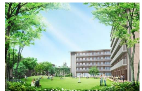
〈Image - New Student Dormitories〉

At ICU, foreign language instruction has featured mostly Western languages, Chinese and Korean. In FY2015, we started offering Arabic and Indonesian. Twenty seven (quota: 30) students took the introductory course in Arabic and 45, in Indonesian. Instruction in a second foreign language is now offered in nine languages, expanding the opportunity for students to choose from a diverse range of languages.