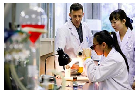
(During a chemistry experiment)

In 2014, a welcome “Meet and Greet” and “Dean’s Reception” organized by the April and September upper class students were held for new September students. This event not only promoted interaction between the two groups of students, but also served as an orientation for other student-run events and short-trip to facilitate April and September students’ communication.