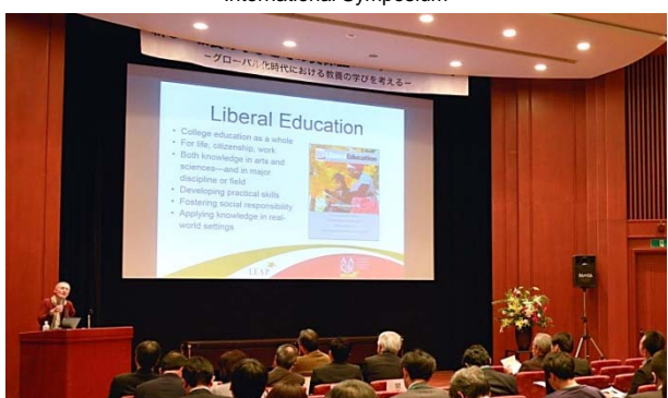
1-(2). Keynote Lecture at the Top Global University Project International Symposium