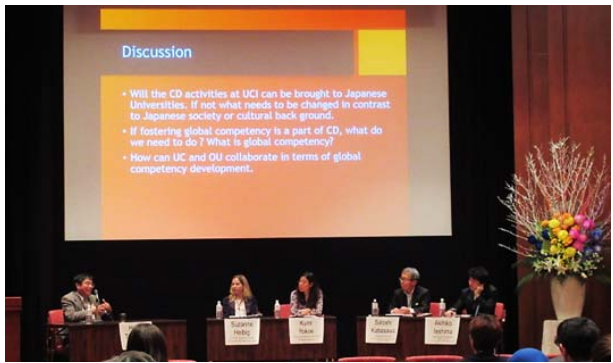
1-(1). Panel Discussion at the UC/UCEAP Osaka Office First-year Anniversary International Symposium

Osaka University is a member of the Association of Pacific Rim Universities (APRU), comprised of top research universities in the Pacific Rim area. In June 2015, Osaka University hosted prestigious APRU's Annual Presidents Meetings with the theme "University as an Agent for Global Transformation." The meeting hosted 106 guests—including 25 presidents— and composed of panel discussions that revisited the mission of universities in the 21st century and discussed the university's role as a proactive instrument of global transformation.