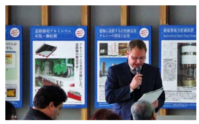
1. 2014 International Joint Research Promotion Program Workshop