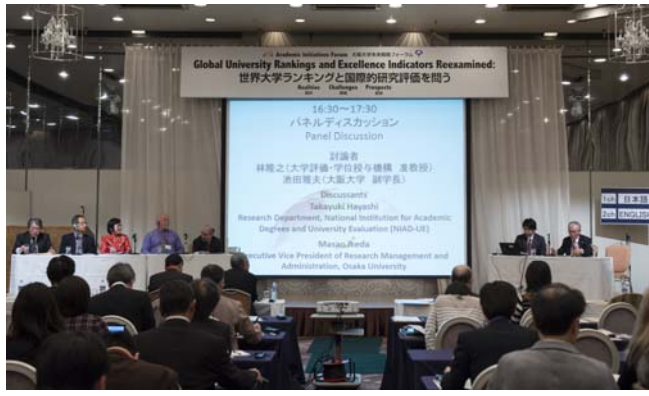
2. Academic Initiative Forum "Global University Rankings and Excellence Indicators Reexamined"