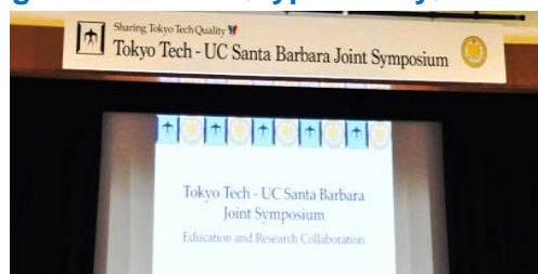
Joint symposium with University of California, Santa Barbara

The Tokyo Tech-UC Santa Barbara Joint Symposium held at Tokyo Tech in August 2015 further strengthened the university-wide agreement between the institutions. Visitors from UCSB included the chancellor, faculty from various fields, and students. The 3-day event included university overviews, research presentations by Tokyo Tech and UCSB faculty, field meetings, and a student workshop.