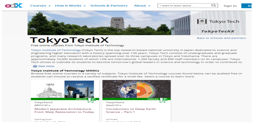
TokyoTechX page on edX platform

With educational assessment, professional development of faculty, and improvement of the learning environment as its three pillars, the Center for Innovative Teaching and Learning (CITL) was established in April 2015 with two professors at its helm. Since then, CITL has carried out training sessions on teaching methods in English, published MOOCs on the edX platform, and held symposiums with prominent international researchers.