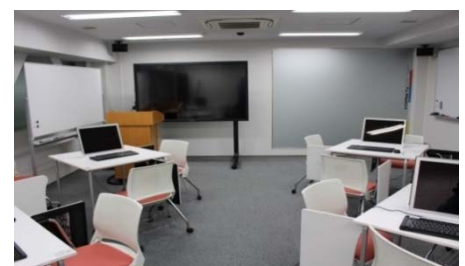
Lecture room with active learning environment

Tokyo Tech held a two-day workshop consisting of a lecture by a professor from UC Berkeley, case studies by Tokyo Tech professors, and group work and discussions between students and faculty members in preparation for the new dynamic Teaching Assistant system.