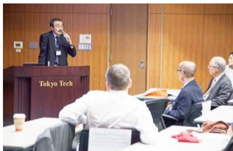
2nd Uppsala University-Tokyo Tech Joint Symposium

The 2nd Uppsala University-Tokyo Tech Joint Symposium was held at Tokyo Tech in November 2015. Under the theme Emerging Technologies and Systems for a Sustainable Society, participants shared findings and exchanged views on next generation solar cells, industry-academia collaboration, and the establishment of startups.