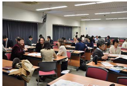
Lecture and workshop on the future of liberal arts at Tokyo Tech