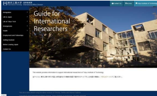
English website for visiting international researchers