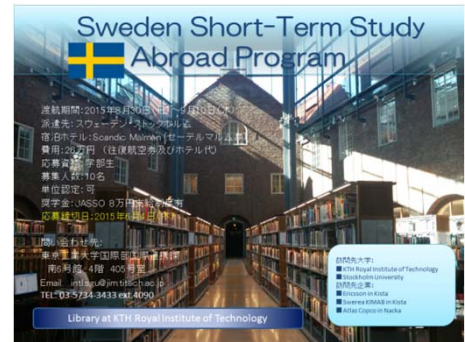
Sweden short-term study aboard program

Various student exchange programs have been developed based on visits to overseas universities. Short-term programs in Europe (Germany, Austria, Sweden) and overseas English training programs for science and technology students in Australia will begin in the summer of 2015.