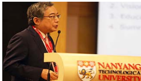
Joint workshop with Nanyang Technological University

The NTU-Tokyo Tech Joint Workshop, held in Singapore in February 2016, gave Tokyo Tech researchers a chance to exchange views on collaborative research with counterparts at Nanyang Technological University.