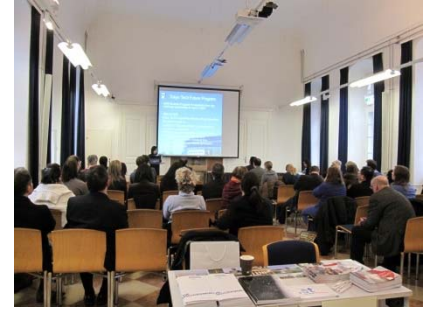
Administrative staff giving presentation in Germany on programs in Japan

In addition to overseas language studies, administrative staff members were provided with on-the-job training opportunities in conjunction with overseas university visits. Discussion, presentations, and negotiations during the visits improved their global competency skills. Tokyo Tech also hosted staff members from overseas partners for the same effect.