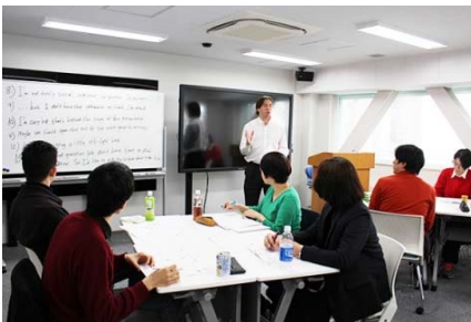
Faculty training on teaching in English

The Center for Innovative Teaching and Learning (CITL) was launched to promote faculty development and ensure education quality. Some examples of professional development include training sessions on teaching methods in English, workshops on the execution of the new curriculum, and discussions about liberal arts at Tokyo Tech.