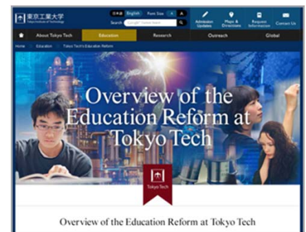
Education reforms website