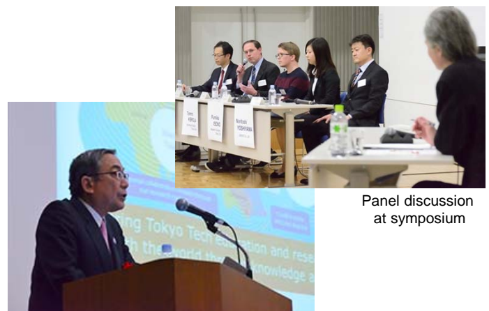
Panel discussion at symposium

The top global university project kick-off symposium was held at Tokyo Tech on January 27, 2015. Guests from Nanyang Technological University and UC Berkeley gave lectures on administrative reforms and the online education environment, and shared ideas regarding Tokyo Tech's strengths and the challenges posed by the current reforms. The symposium was an important milestone in the Institute's globalization efforts, and showed the unity of all those involved in changing what was a Japanese university to a truly global Tokyo Tech.