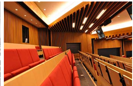
Tokyo Tech Lecture Theatre