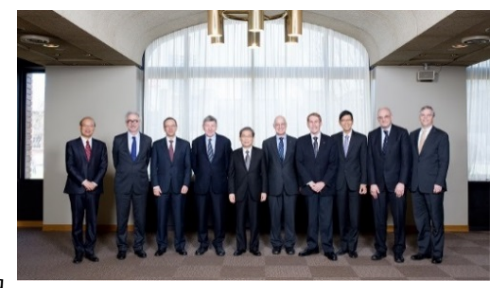
⟨ IARU Presidents' meeting 2015 ⟩

There are more than 3,000 UTokyo students studying abroad for research including field work projects. Newly introduced academic calendar policy enables students to flexibly schedule for studying abroad.