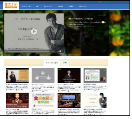
〈 UTokyo TV Top Page 〉

UTokyo has been providing platforms such as UTokyo iTunes, UTokyo TV, UTokyo OCW in order to disseminate information to all first year students each year. The platforms above had already steered awareness towards online and allowed a smooth shift to MOOCs for open online courses. The access quantity in 2015 dramatically increased by 261% compared to that of the previous year.