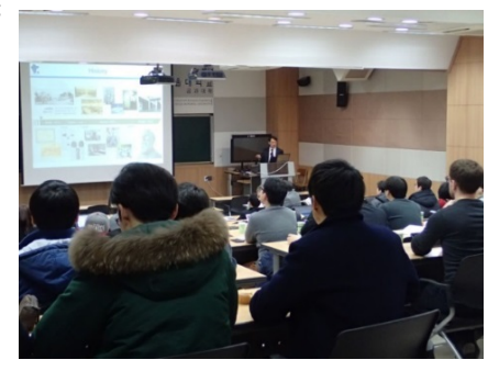
⟨ A workshop at SNU ⟩

UTokyo has strengthened its strategic relationship with SNU to promote mutual exchanges based on existing academic exchange agreements among the faculties and as well as newly concluded agreements. Collaborative conferences, symposiums, and seminars were organized at SNU. In 2015, joint events to make use of SNU's own knowledge and the latest information will be organized on our campus to plan and structure higher education programs.