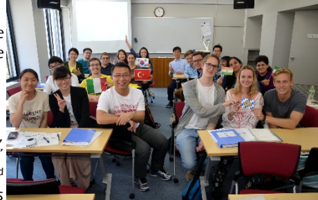
⟨ Japanese Class Students ⟩

In addition to the "PEAK" courses where students can obtain a degree solely using English, established in the College of Arts and Sciences, in April 2014the "Global Science Course" was established in the School of Sciences. Students are admitted by transferring into the 3<sup>rd</sup> year. Such university-wide initiatives to increase the number of classes in foreign languages are thought to contribute towards international student mobility.