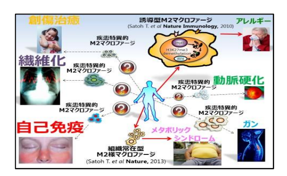
Figure2 disorder-specific M2 macrophages