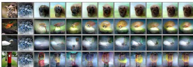
Figure 1. Deep image reconstruction

Mental images are a crucial component of our mind. Besides stimulus-induced perception, memory recall, dreams, and hallucinations also involve mental images. Experienced images can be different from the physical features of the stimulus in optical illusions. How are these diverse images generated in the brain? In psychology and cognitive neuroscience, mental images have been studied by indirect behavioral measures, and it has been difficult to visualize the specific contents. We have developed a brain decoding method combined with the representation of deep neural network, and used it to visualize perceptual and recalled images (Figure 1). In this study, we extend this visualization approach to elucidate the neural mechanisms that generate various kinds of mental images including illusions and dreams.