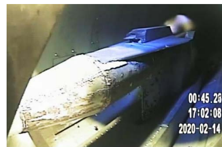
Figure 2 Combustion test under Mach 4 condition