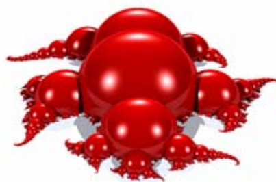
The convex hull of a Kleinian group