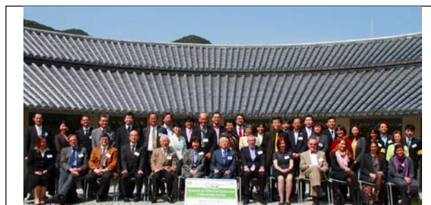
Figure 2 Awaji Symposium

Firstly, reveal the Japanese position in the world stage by the elaboration of international legal indicators on Participation Principle.