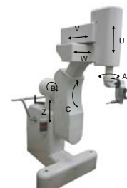
Fig. 2 Bone-cutting robot

We have investigated some micro-scale phenomena of bone cutting. In this project, we will develop optimized bone-cutting techniques, facilitating the regeneration of bone tissue after cutting. We will also integrate tool path generation methods to minimize operation time and skin incision.