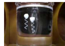
Fig. 3 Microrobots

We will develop the electromagnetic control of tetherless microrobots and investigate their further miniaturization using the latest manufacturing technologies.