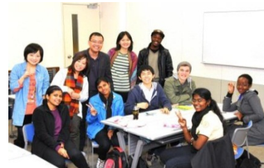
A coed program between foreign and Japanese students

In order to cultivate staff who are fluent in English, we will carry out English training and SD overseas training. We will aim for 25% of our staff to achieve a TOEIC® score of 730 or higher by fiscal year 2016.