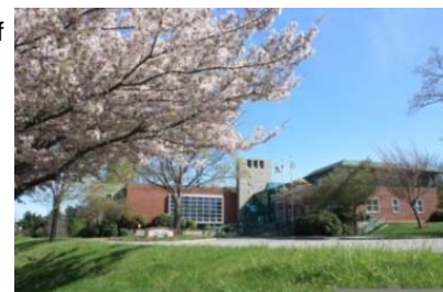
〈Spring at Showa Boston〉

As well as rigorously aiming for globalization throughout the university, the Center for International Exchange (CIE) will lead an initiative to have various regulations, administrative documents, internal notices and other paperwork printed in both Japanese and English. Steps will also be taken to develop teaching staff as global human resources through the teacher training program at Boston.