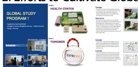
Active Learning Example

Provide support to students studying abroad via International Support Desk (ISD). Investigate the possibility of designing a separate internal scholarship scheme. Promote the mutual recognition of credits through the active acquisition of learning agreements.