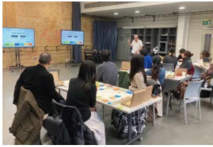
〈 Program for outbound students: A UAL workshop attended by undergrads and grad students 〉