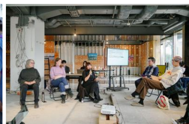
〈 Monash PhD student's presentation〉