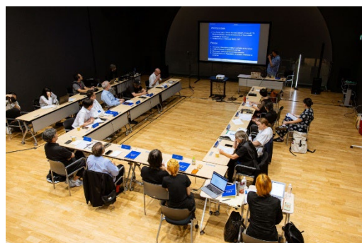
〈Shared Campus Board of Directors meeting〉

In June 2024, our university hosted the Shared Campus Board of Directors meeting. Presidents, vice-presidents, and other representatives from internationally renowned arts universities visited Tokyo to discuss international collaboration, with a focus on advancing arts education and research in higher education.