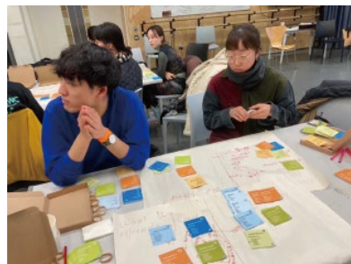
〈 A UAL workshop on REBEL 〉

Inbound: The attendees presented their learning experiences and creations in the programs. The presentations offered an artistic take on the environmental problems and the topographical and climatic conditions in the students’ home countries.