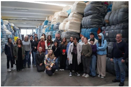
⟨Summer School Program in Prato with Monash⟩