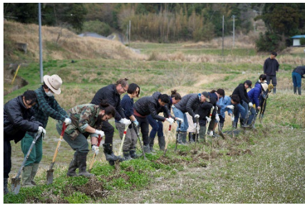
〈 Program for inbound students: The students reconsider environmental destruction in a farming experience in Kamogawa, Chiba 〉