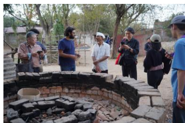
〈 NID Traditional Crafts Research〉

For exchange programs such as the Summer Program, we conduct a qualitative evaluation by reviewing the exhibition of final results and critiquing them with faculty members from partner universities. Additionally, new methods of educational evaluation have been introduced in the REBEL System to strengthen our quality assurance framework.