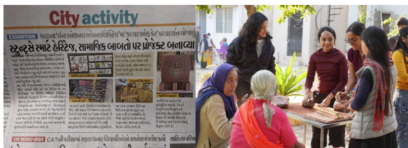
〈Left: Local newspaper coverage of the summer program with NID / Right: Program activities in Ahmedabad〉

The exchange programs strengthened ties with local communities through workshops in collaboration with welfare facilities, universities, and NGOs, fostering socially engaged art practices, student initiative, and international collaboration. The advanced and practice-oriented initiatives with NID were also featured in local and international media, drawing wide attention.