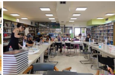
〈 Art work making process by students in Athens〉