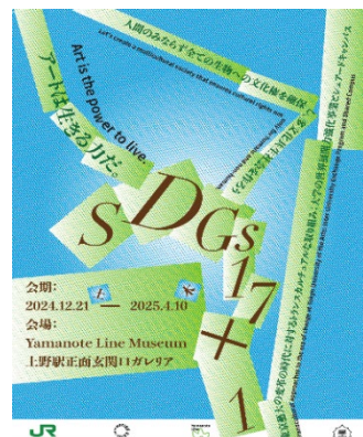
〈Pamphlet of the Outcome Exhibition〉

The outcome exhibition of this project, “SDGs 17+1: Art is the Power to Live – Securing Cultural Rights for All Living Beings and Creating a Multicultural Society,” was held at the Yamanote Line Museum at Ueno station, Tokyo, from December 2024 to April 2025. It showcased works by our students and faculty as well as those from partner institutions, broadly sharing the project’s outcome with society.