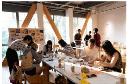
⟨Research Residency Program in Tokyo with NID⟩

With the aim of promoting cross-border academic exchange to address global challenges, in the 2024 academic year we implemented (1) Summer Programs, (2) Semester Programs, and (3) Lecture Programs . Through active collaboration with our partner institutions—the University of the Arts London (UK), Monash University (Australia), and the National Institute of Design (India)— we achieved outcomes that significantly exceeded our initial plans in both sending and hosting participants.