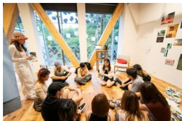
〈 Scenes of student critiques at the summer school in Tokyo〉