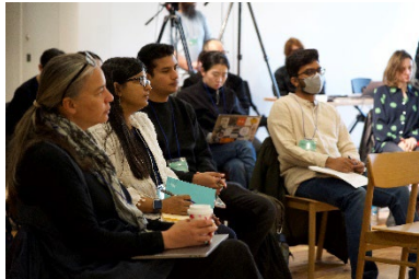
〈 Program for inbound students: Kick-off meeting 〉