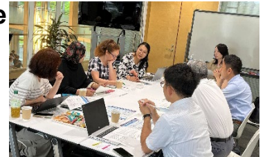
(Discussion on joint graduate school)

We are preparing to incorporate ICL into short-term inbound programs and issue Open Badges certified by Tohoku University to those who complete the program to make their international validity and learning achievements visible.