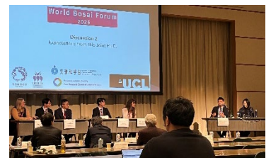
(WBF2025 Panel Discussion)