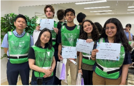
(Disaster drill at Fujisaki Department Store)