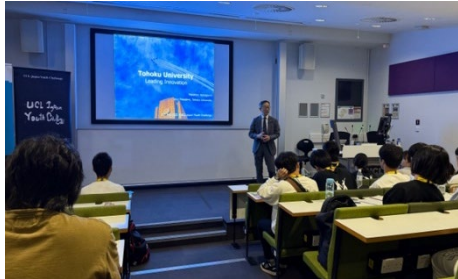
(Presentations at the UCL-Japan Youth Challenge)

■ We are conducting various efforts in cooperation with local actors to return our disaster science expertise to the community and contribute to the creation of a disaster-resistant urban environment in Sendai. Since FY 2024, the Sendai-based Fujisaki department store, which has branches throughout the Tohoku region, has held disaster training, incorporating lectures and discussion, for international students. In the summer of 2025, we sent four intern students from UCL 's RDR department to receive evacuation training and discuss disaster prevention for diverse groups of people. This event was held with cooperation from Sendai City and helped promote diversity within a disaster-resistant urban environment.