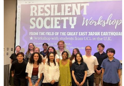
〈 Student-led workshop 〉

Because this program spans multiple university departments, a steering committee meeting, attended by deans from the relevant graduate schools, and executive committee meeting, attended by administrative staff, were held. Additionally, the relevant personnel periodically hold meetings to ensure tight communication and cooperation within the university. Self-evaluation of our progress is conducted by an external evaluation committee comprising disaster science researchers, instructors with deep experience in international student exchange, and experts from the Sendai International Association.