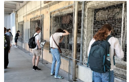
(Visit to earthquake memorial site/Ishinomaki Kadonowaki Elementary School)

We are making steady progress towards "increasing our international presence" and "building a joint international knowledge base for synergy between educational reform and research capacity enhancement" by leveraging strengthened cooperative agreements between both universities' leaders, discussing implementation of joint international education, leveraging competitive, high-quality student exchange programs, and utilizing educational/research exchange between instructors.