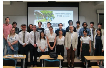
(Student-led resilience workshop)