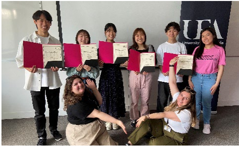
(Short-term outbound program in the UEA)

✓ In May we conducted a pre-arrival online Japanese language course to prepare international students for daily life, fieldwork, and natural disasters so they could smoothly adapt to life in Japan. The course included ICL/exchange learning opportunities with Tohoku University students.