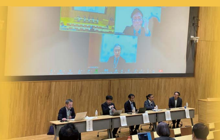
◀ A photo from The 1st Forum (2024)