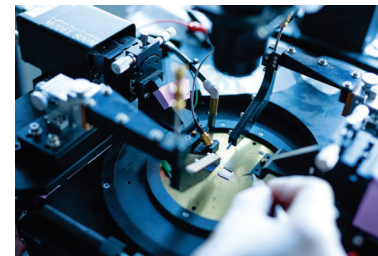
Figure 2 A system for experimental investigation of spin and orbital currents

Principles and methods of manipulating angular momentum currents will enable the design of devices based on new principles with higher efficiencies than conventional spintronics devices.