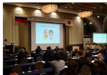
(Japan-Russia Joint Symposium on Educational and Scientific Development in Medicine = Niigata city)

Administration of the entire project and public relations were carried out by Control Center. Japan-Russia Joint Symposium on Educational and Scientific Development in Medicine 2018 was held in Niigata. Teaching staff from Japanese and Russian universities gave a summary of project details and progress and discussed measures for promoting the ongoing exchange activities in the future. The project received the "S grade", the highest evaluation from members of internal and external evaluation committees held at the end of the fiscal year.