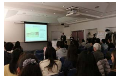
(Russian students making presentation at the public lecture)

"Healthcare center" which consists of four doctors including psychiatrist was established within the University to support foreign students. This organization can take care about physical and mental health of students. We also made a list of 8 hospitals located in Niigata city where students can communicate with doctors in English, so students can go there if they have health problems and in case of emergency as well. As for the Japanese language learning support, it should be mentioned that invited lecturers gave a course of lectures in "Medical Japanese". From 2016 Japanese became a part of syllabus for foreign students of the Medical and Dental Schools. Niigata University together with partner universities organized "Japan-Russia Emergency Contact Network" for inbound and outbound students, assistance is available 24 hours a day. For both Japanese and Russian students fully equipped accommodation within the campus or near is available for free.