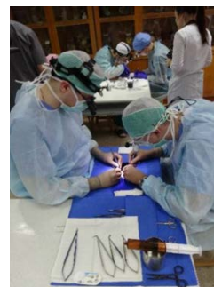
〈 At Far Eastern Federal District Regional Student Surgical Olympics 〉

Administration of the entire project and public relations are carried out by Control Center. International Cooperation Steering Committee was held four times last fiscal year and at the end of the fiscal year Internal and External Evaluation Committee meetings were held. Results of the consultation and advice from evaluation committees were included in the business plan of this fiscal year and widely reported on symposiums, workshops and FDs. Results of this inter-university exchange project can be already seen and it continues to spread to other medical universities in Russia. It is planned to engage more Russian universities in the project. St. Petersburg State University, North-Eastern Federal University (Yakutsk) and Kazan Federal University plan to join Summer Exchange Program.