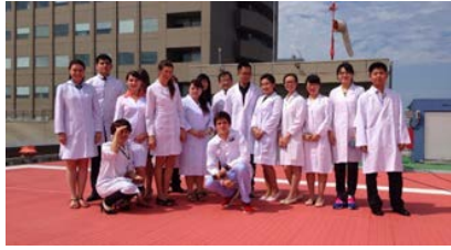
<Summer medical student exchange program 2015>

2014 was a preparation period in order to establish a full-fledged program, so we laid the groundwork of future student exchanges which will in fact start in 2015. At first, we have established a Control Center which consists of competent professionals with necessary language skills and rich international experience in order to set up the collaboration with partner universities in a close contact. In addition, a booklet, leaflets were issued and project website was created in order to introduce this project widely, not only in medical campus but within the whole university. Sessions of Internal and External Steering Committees, Evaluation Committee hearing were held; people in charge of the project and Control Center personnel visited partner universities several times, held meetings and carried out FD in order to explain the program content fully; administrative and management systems of the project were set up.