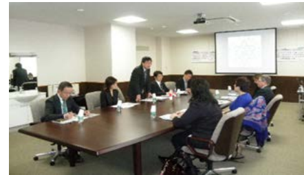
<Conference on International Cooperation Management >

Together with Academic Affairs Division of Niigata University School of Medicine we have managed the strict credit transfer and accumulation system for PhD students. Control Center which is responsible for the entire program management and public relations was organized. In addition, University Steering Committee and International Steering Committee were set up. Conference on International Cooperation Management was held in March. It gave a chance to discuss problems and difficulties of the project implementation, to share the necessary information. Working group consisting of competent professionals was also organized, it helped to improve the program a lot.