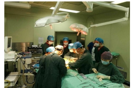
(Practice at the operating room = Niigata University)

Administration of the entire project and public relations are carried out by Control Center. The International Cooperation Steering Committee was held at Pacific State Medical University in 2017 and faculty members from Japan and Russia had a chance to discuss the project thoroughly. Results were widely reported on symposiums, workshops and FDs. Faculty members from the Russian side participated in the external evaluation committee, both external and internal evaluation committees were conducted at the end of the fiscal year and results were reported. Omissions pointed out by the evaluation committee will be introduced in the project implementation plan for 2018 and will be improved. In February one faculty member of Pacific State Medical University was appointed the liaison professor of our university. Three liaison professors teach students in Russia as teachers of our university. Results of this inter-university exchange project continue spreading to other Russian medical universities. The inter-university agreement with St. Petersburg State University was concluded in 2016. In addition, we have concluded inter-faculty agreements with North-Eastern Federal University (Yakutsk), Institute of Fundamental Medicine and biology of Kazan Federal University and Kazan Medical University in 2017 and student exchange was started. Dean of Fundamental Medicine Faculty of Moscow State University also signed the inter-faculty agreement. It is planned to start student exchange from 2018.