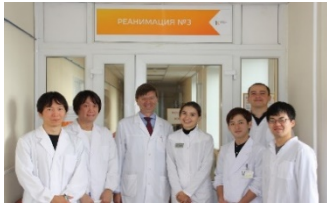
(Students studying at "Japan-Russia Center of Microbiology, Epidemiology and Infectious Diseases"=Krasnoyarsk State Medical University)