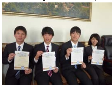
〈 Students of Niigata University with certificates of completion〉

Construction of the global framework promoting the collaborative education and career development for young medical students in Japan and Russia