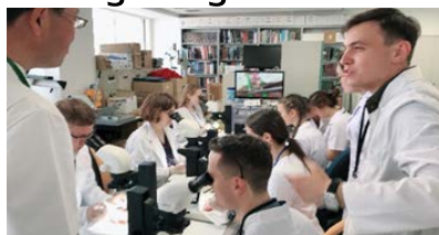
(Summer Medical Exchange Program=Niigata University)

In 2018, target numbers for A. Undergraduate medical student exchange (① Summer Exchange Program, ② Medical Research Training Program), B. Graduate Student Exchange (③ DDP-Double Degree Program, ④RPP-Regular PhD Program) were exceeded . Inter-faculty exchange agreement with Moscow State University was concluded in 2017 and student exchange between universities started from 2018. In addition, inter-university exchange agreement with Sechenov First Moscow State Medical University (Moscow) was concluded in 2018. We plan to start student exchange from 2019. In all the programs, we enhanced contents of all the programs from the viewpoint of student education and research promotion, and worked to promote cross-cultural understanding through participation in exchange events and local festivals, etc. even outside the academic field.