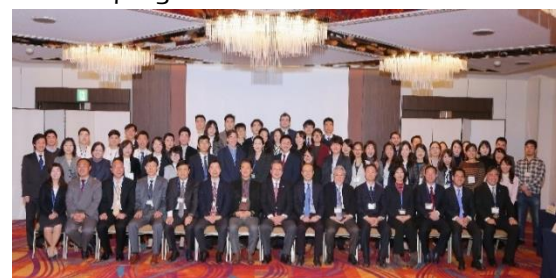
Joint International Symposium (Kobe, Japan)