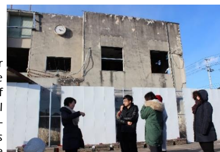
Fieldtrip to Tohoku Earthquake Stricken Area (Otsuchi-cho)