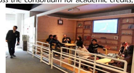
Experiencing Earthquake Simulator at Nojima Fault Fieldtrip to Awaji Island