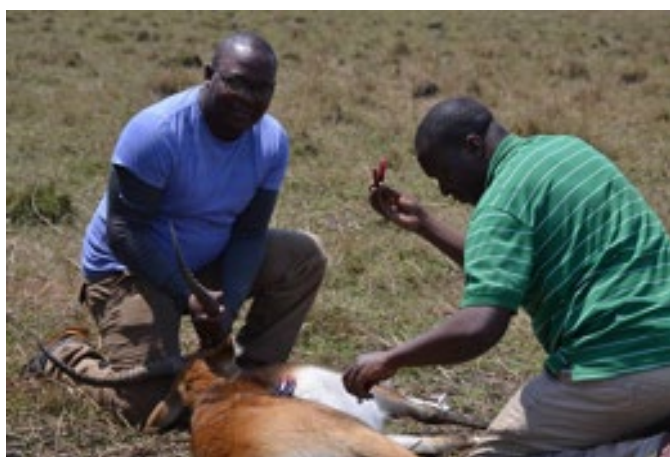
Collection of blood samples from wildlife in the Kafue ecosystem, Zambia