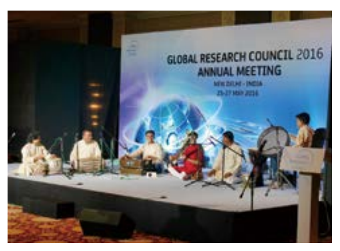
For further details on GRC activities, please see the following website: http://www.globalresearchcouncil.org/

Major milestones have been achieved over the four years since the GRC was established. By strengthening yet further the GRC's programs and initiatives, it is expected that new and innovative frameworks and strategies will be developed that link even closer the world's HORCs in a consortium of research funding and science promotion aimed at robustly tackling common global "grand challenges."