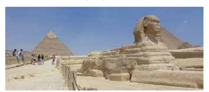
Sphinx and Pyramids, Cairo

The Second E-JUST International Conference, this time on Innovative Engineering, was held on 19-21 May in Alexandria. E-JUST stands for "Egypt-Japan University of Science and