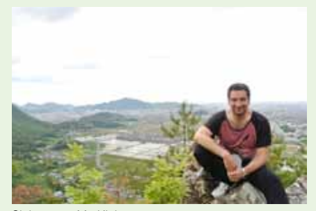
Sitting atop Mt. Kinka

So, I would recommend Gifu to those who are looking for a relaxing holiday or who are interested in history and traditional crafts.