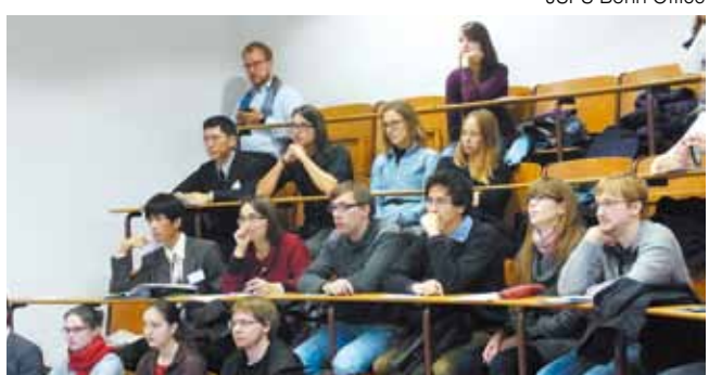
Students listening to briefing