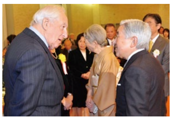
Dr. Altman talking with Emperor Akihito

Congratulatory remarks followed from the Prime Minister (read