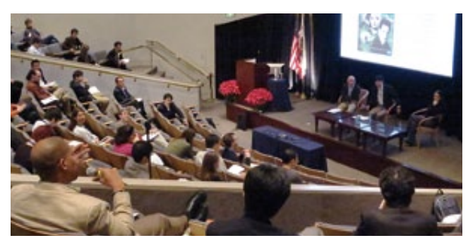
Japanese-American Frontiers of Science (JAFoS) symposium

researchers (30-40 from each Japan and the counterpart country) lodged together in a hotel to expand the time they had to get to know and interact with each other. Over the 3-day events, speakers gave presentations on the interesting aspects of various cuttingedge scientific topics, about which the participants engaged in free discussions. This format provides a challenging yet valuable opportunity for the speakers who must convey what's fascinating about their fields to other researchers, many of whom are not conversant in their jargon when listening to the presentations or feeding back their ideas when discussing them. The participants, on the other hand, are given the chance to learn about and discuss cutting-edge research topics across interdisciplinary lines with frontline researchers in each of the subject fields. In FoS symposiums, there is no question that can't be asked: Even the simplest inquiries may probe the heart of an issue. It was amidst this sort of free atmosphere that the participants enjoyed a world purely devoted to science away from the bustle of their everyday working environment. As in the past, the discussions were propelled by the mediation of the session coordinators played by planning group members, the meticulous preparation of the chairs and speakers, and the vigorous voicing of views and questions by the participants.