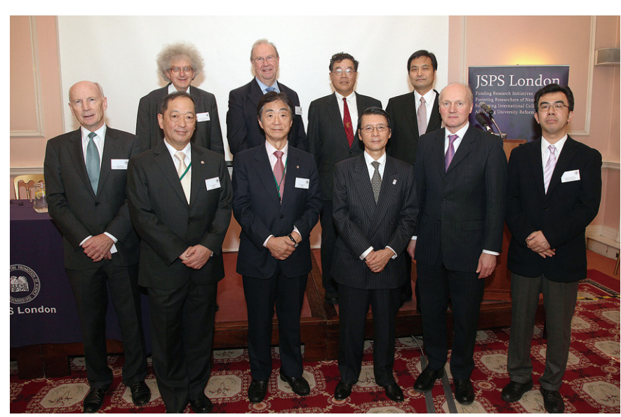
Speakers at JSPS 80th Anniversary Event

At the reception, JSPS's anniversary was celebrated by breaking the seal of a large barrel of sake in a traditional Kagami