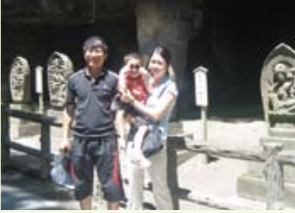
Family photo at Zuigan-ji Temple in Matsushima

The Japanese are very fond of their country's four distinct seasons. Located about 300 kilometers north of Tokyo, Sendai superbly reflects this seasonal transition. In the winter, the area experiences snowfall, though not as heavy in the lowlands as other parts of northern Japan. In the summer, the temperature is much cooler than in the southern area of the country. Spring seems short-a transitional period between winter and summer, accented by the budding and bloom of plum, peach and cherry trees. Autumn is perhaps the most wonderful season with its mild climate and deep blue sky. It is the season when red and yellow leaves paint the landscape, with nature's colors spreading from the valleys across the mountain slopes. A relatively small city with a population of more or less a million, Sendai is often called an "academic city" due to its atypically large educational sector. Life in Sendai is, therefore, more relaxed than in the bustling big cities to the south.