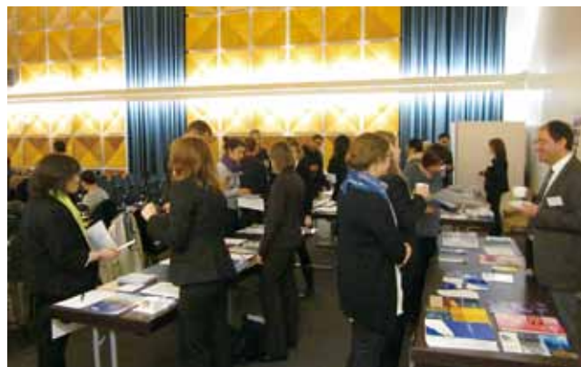
Special student corner