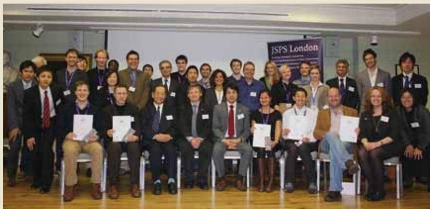
Alumni Evening: Re-visitation and symposium awardees seated in the front row, October 2011

Between 2008 and 2009, the launching of two re-visitation programmes helped spur a