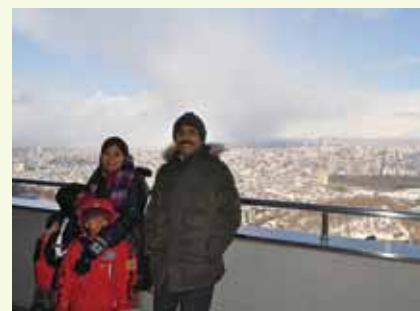
Viewing platform atop Mt. Okura

All in all, I'd say that Sapporo offers attractions for people with a wide range of interests.