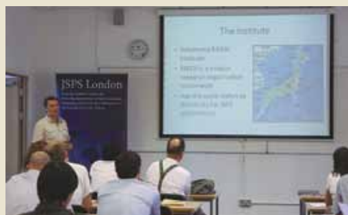
JSPS programme introduction at Aston University, September 2011

Please visit the following website for more information on the UK JSPS Alumni Association: http://www.jspso.org/alumni/ .