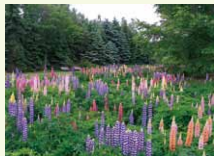
Inside Yurigahara Park