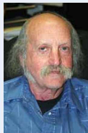
Dr. Eric Harris Davidson

To commemorate the award to Dr. Davidson, the 27 th International Prize for Biology Commemorative Sym-