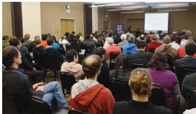
— JSPS Washington Office

assembly, in which the state of its activities were discussed and next year's program planned.